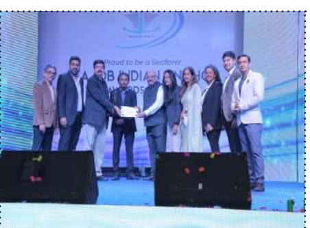
MMS Maritime India - Best Employer for Chemical Tanker Fleet-SC