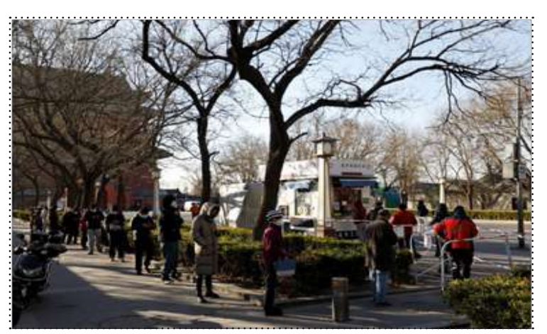
People line up at a nucleic acid testing site to get tested for Covid-19 in Beijing, China.

This is the latest in an easing of curbs across the country following last month's historic protests that marked the biggest show of public