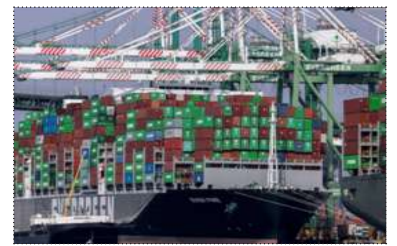
But a few months on, carriers are racking up some serious voyage losses on ships that do sail, and bleeding from high overheads with no revenue from the sailings they blank.

An ocean carrier will make every effort to maximise the load on a vessel's maiden call, even topping up the deck with empty containers to