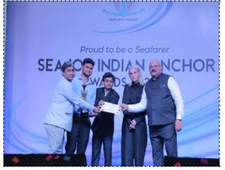
Sinasta Maritime- Company with max all type vessels-PC