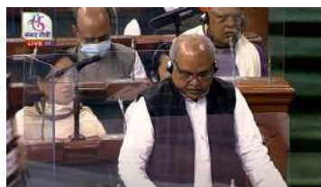
Union Minister of Agriculture and Farmers Welfare Shri Narendra Singh Tomar

The National Food Security Mission (NFSM)-Pulses programme is being implemented in 28 states and 2 Union Territories (i.e, Jammu & Kashmir and Ladakh) and NFSM-Oil