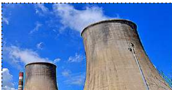
A view of the NTPC Simhadri Thermal Power Station in Visakhapatnam

NTPC is considering deploying small-scale modular reactors, known as SMRs, as part of the strategy, according to multiple people with knowledge of the company's plans. The producer has an overall power fleet of 70 gigawatts,