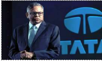
N Chandrasekaran, Chairman, Tata Sons

Chandra has been spearheading Tata group's transformation since he took over as its Chairman in 2017. Recently, the group launched a super app called Tata Neu in a bid to provide a single platform for consumers to buy