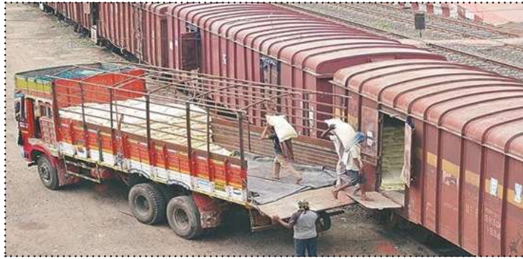
Indian Railways freight train

In revenue terms, the Railways freight revenues stood close to Rs. 1, 08,593 Cr. in the current year vis-a-vis Rs. 93,532 Cr during last year till December 06th, thus