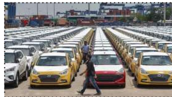
The auto industry in November has clocked the highest retail sales in history on year-on-year (YoY) basis

Similarly, two-wheeler sales also grew by more than 23 per cent to 18,