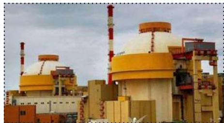
Kudangulam Nuclear Power Station

The full capacity of Six Thousand MW at Kudangulam Nuclear Power Station in South Tamil Nadu Coast will be commissioned in the next five years Minister of state for atomic energy Dr Jitendra Singh said in a written answer to the Rajya Sabha