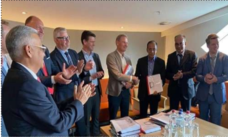
IHD and Cochin Shipyard sign agreement for a TSHD

will be used by DCI for safeguarding and improving the accessibility