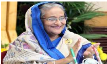
Bangladesh Prime Minister Ms Sheikh Hasina

Bangladesh Prime Minister Ms Sheikh Hasina, reviewed the International Fleet comprising ships from Bangladesh Navy and eight ships from six foreign