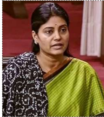
Minister of State for Commerce Anupriya Patel

Country and product-specific action plans have also been formulated to promote exports. The Government is also in the process to utilize the