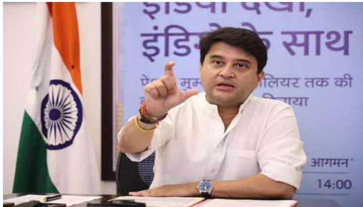
Civil Aviation Minister Jyotiraditya Scindia

Chennai airport. We are spending almost Rs 2,895 crore for the Chennai airport expansion plan. The probable time of completion of the work is somewhere in 2024. As soon as that is completed,