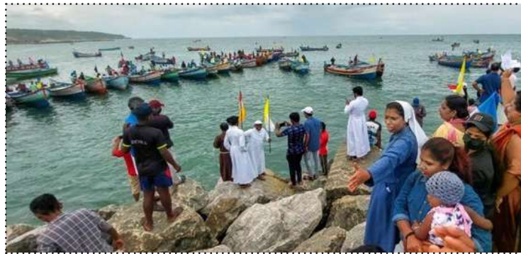
Vizhinjam seaport project would be completed on time despite losing 100 working days due to protests says Kerala port minister.

"The port is likely to bring indirect economic growth. It will pave the way for more warehouses, hotels and residential buildings. The company has agreed