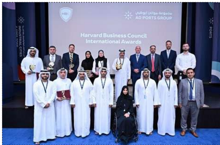
Representatives from Harvard Business Council visited AD Ports Group HQ to present the accolades and celebrate success in achieving top winner status for the 2022 awards second cycle.

AD Ports Group's Ports cluster was presented with the Diamond Level Organisational Award ; this is the highest award