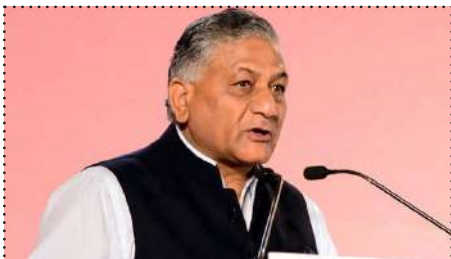
Ministry of Civil Aviation Gen. (Dr) V. K. Singh (Retd)

The Civil Aviation Ministry has accorded ‘In-Principle’ approval for setting up of 21 Greenfield Airports in various parts of the country Minister of state for civil aviation General V K Singh informed the Lok sabha in a written answer.