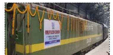
First ECR freight train leaves new Paradip Cargo Terminal

GCTs are being developed by private players on non-railway land or fully/partially on railway land for handling rail cargo.