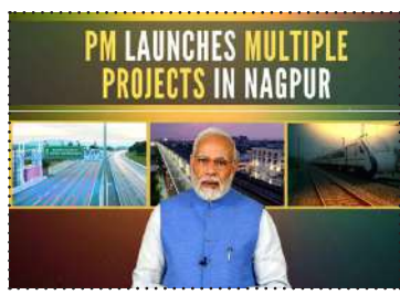
PM Modi launching multiple projects in Nagpur

Drime Minister Shri Narendra Modi on Sunday 11 Dec inaugurated Nagpur-Mumbai Expressway in the state of Maharashtra. He officially launched Phase-I of Hindu Hrudaysamrat Balasaheb Thackeray Maharashtra