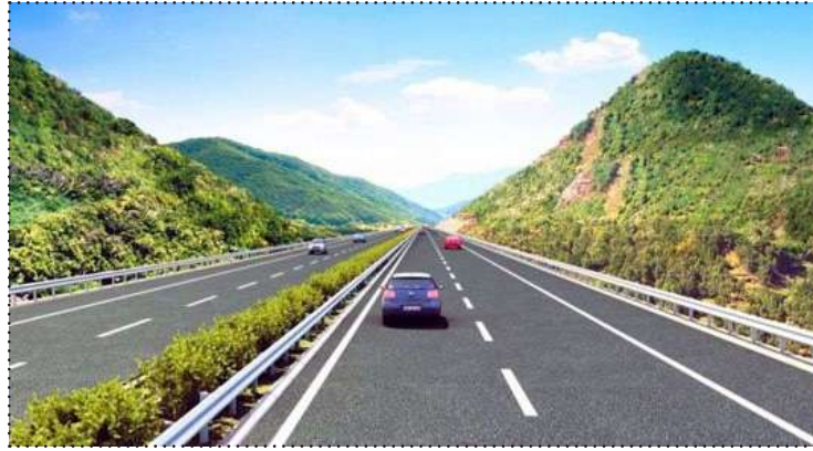
Char Dham expressway

Responding to queries in Rajya Sabha about the project, which aims to improve connectivity to Badrinath, Kedarnath, Yamunotri and Gangotri, the Minister of highways Nitin Gadkari informed the House that 21 packages covering a length of 291 km are complete and two packages are yet to be awarded. One package was de-sanctioned and