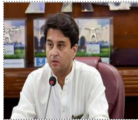
Civil Aviation Minister Jyotiraditya Scindia

(Ever since he took over as Civil Aviation minister two years ago, Mr Scindia has been concentrating on developing aviation infra in his home state Madhya Pradesh and