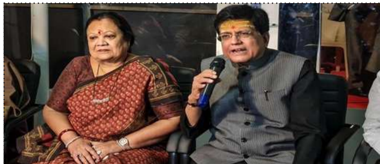
Piyush Goyal and Minister of State for Textiles Darshana Jardosh address the media in Varanasi

The Cotton Corporation of India and the Cotton Textiles Export Promotion Council (TEXPROCIL)