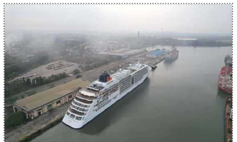
Third cruise ship calls at NMP

The port had made elaborate arrangements for the tourists. A meditation centre was set up at the cruise lounge by the Ayush Department. The tourists were presented mementos before their departure to Kochi, a release from the NMP here said.