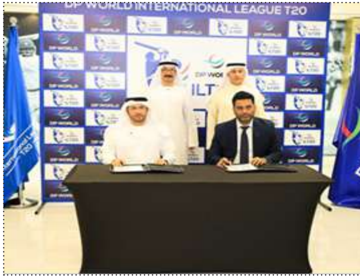
The DP World International League T20, agreement signed.