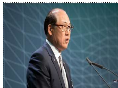
IMO Secretary General Lim.

"There is a growing base of support in the Committee to proceed with development of a GHG levy as well as development of a GHG Fuel Standard. Significant