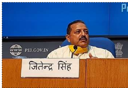
Minister of the Department of atomic energy Jitendra Singh

Two 700 MW units at Rawatbhata in Rajasthan are likely to be completed by 2026, while another two 1,000 MW units are likely to be completed at Kudankulam by 2027, he said. Two 700 MW units are expected to be completed at Gorakhpur in Haryana by 2029, the Union minister informed.