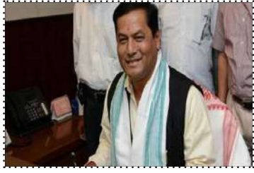
Shipping Minister Sonowal