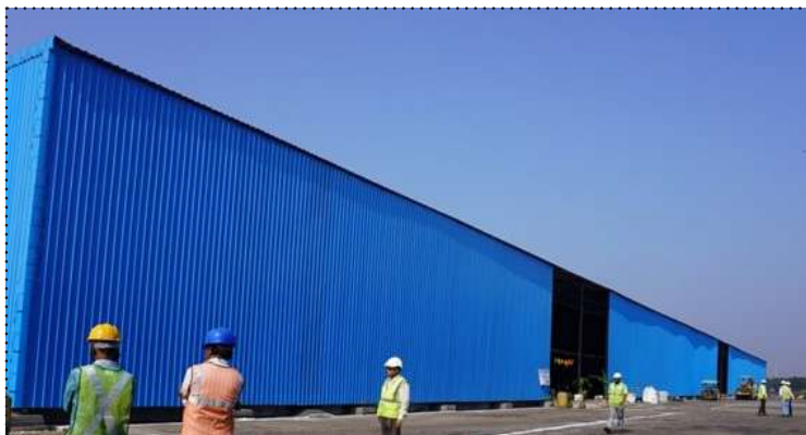
State of the art warehouse at the port

Adani Gangavaram Port handles sensitive cargo such as Fertilizer, Agri