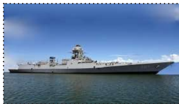
Stealth guided missile destroyer

The event marks the formal induction into the Navy of the second of the four 'Visakhapatnam'