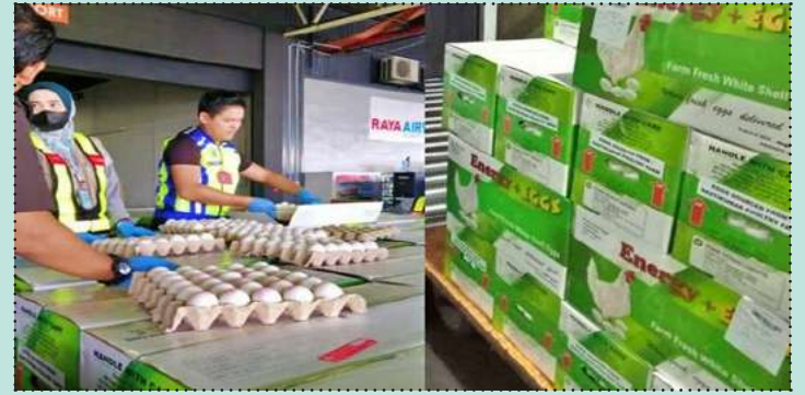
Namakkal eggs fly to Malaysia

The eggs were transported to Kula Lumpur from Tiruchirapalli airport according to an official release