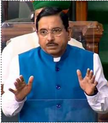
Coal Minister Pralhad Joshi

India has been facing a coal shortage, which led to power outages in many states during the peak of summer in the past two years. Therefore, to meet the coal demand, India