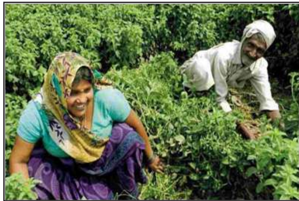
Natural farming spreads

Department of Agriculture and Farmer Welfare (DA&FW) is undertaking large scale training of Master Trainers, Champion Farmers and practicing farmers on techniques of Natural Farming through National Institute of Agricultural Extension Management (MANAGE) and National Center of Organic and Natural Farming (NCONF).