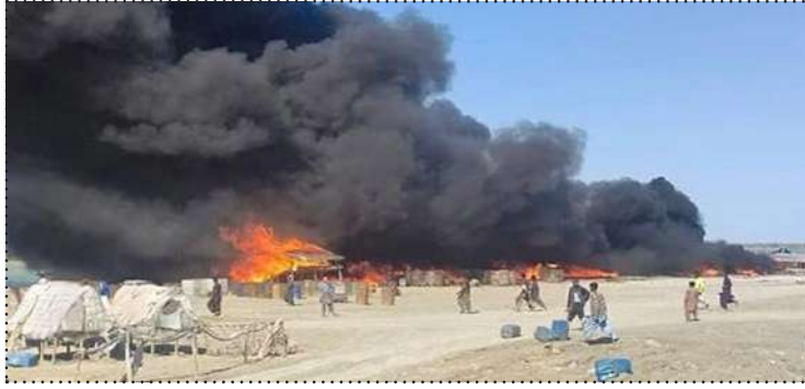
Gwadar port fire: Baloch rebels blow up Pakistani oil reserves

Oil reserves kept in Gwadar, a port city on Balochistan coast, were set on fire allegedly by Baloch rebels. Reports suggested that massive losses are expected after this unprecedented attack. Pakistan's Maritime assets