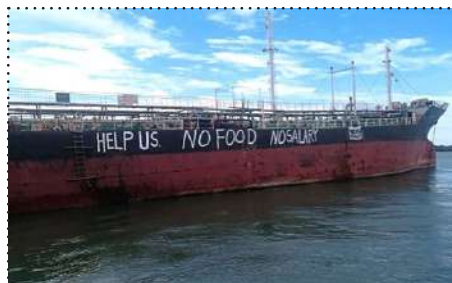
Appeal of the abandoned seafarers

agreements; and relevant trends and developments in regional and national law and practice.