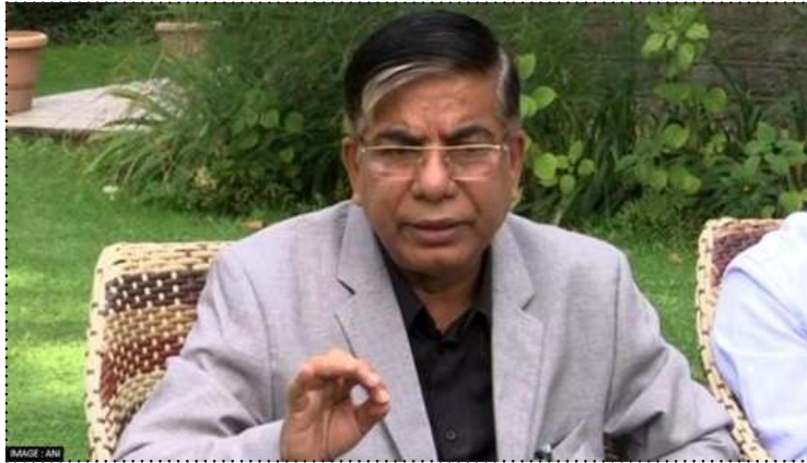
MoS for Education, Dr. Subhas Sarkar

ii. University Grants Commission (UGC) has issued Guidelines