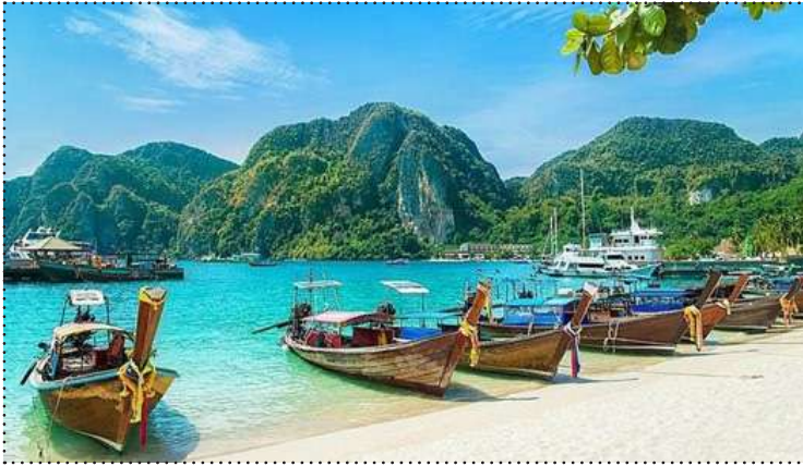
Andaman and Nicobar Islands

The discussion assumes significance with the government going in for a massive container terminal at the Nicobar Islands a few hundred kilometers away from Ache province in Indonesia brushing aside concerns from environmentalists. The government has put the Colachel transshipment terminal for which the