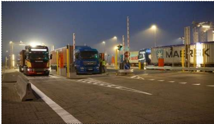
APM Terminals' new Truck Appointment System, piloted earlier this year, is going global

in Monrovia last year, has been rolled out to the West Africa Container Terminal in Onne, and APM Terminals Yucatan. The standardised global solution means that further roll-out can progress quickly, using best-in-class technology.