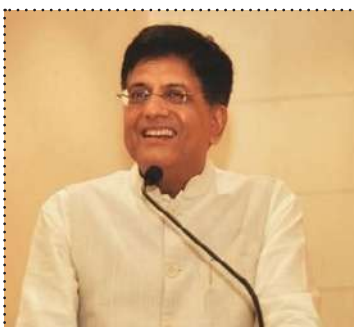
Commerce Minister Goyal

Consensus has been arrived among member countries of the Indo Pacific Economic Framework for Prosperity on setting up an investment forum comprising private and public sector stakeholders to encourage investment in clean energy sector. The consensus was arrived among the member countries during the recent round of talks held at Brisbane in Australia. India has expressed his full support to the negotiations schedule agreed at the