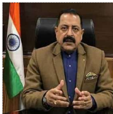
MoS for Atomic Energy and Space, Dr Jitendra Singh

Dr Jitendra Singh said, use of TVS-2M fuel assemblies in