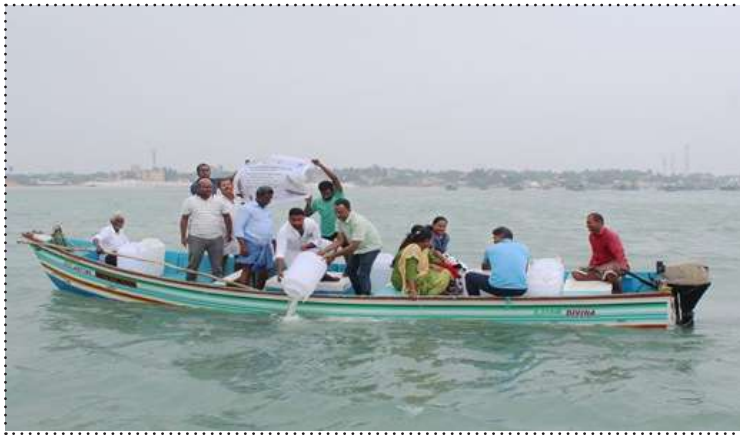
Shrimp seeds being sea ranched