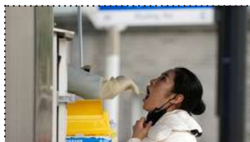
A woman gets swabbed to be tested for the coronavirus disease (COVID-19) at a nucleic acid testing site in Shanghai, China.

In a letter to the states and UTs, Union Health Secretary Rajesh Bhushan said, "In view of the sudden spurt of cases being witnessed in Japan, United States of America, Republic of Korea, Brazil and China, it is essential to gear up the whole genome sequencing of positive case samples to track the variants through Indian SARS-CoV-2 Genomics Consortium (INSACOG) network. Such an exercise will