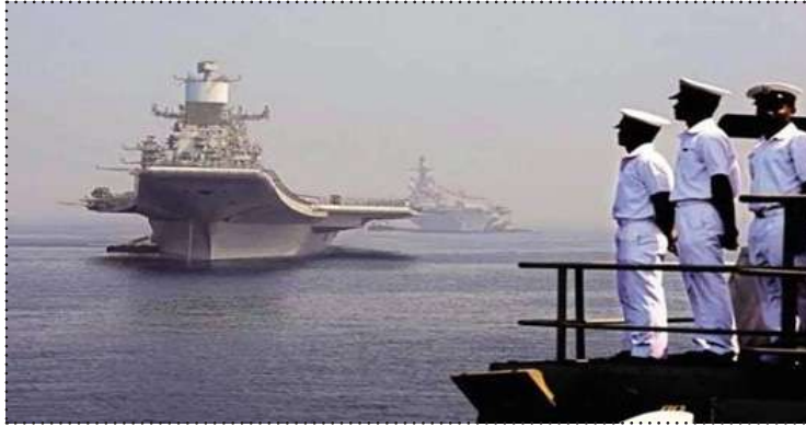
Safeguarding India's EEZ

The Lok Sabha, passed the Anti-Maritime Piracy Bill, 2019, that seeks to provide effect legal aid