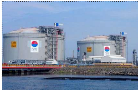
Gopalpur will be the third LNG terminal on the east coast

LNG is natural gas that has undergone supercooling, becoming a liquid with 1/600th the volume of a gas. This facilitates simple ship transit. It is converted back into gas at the receiving facility before being delivered to manufacturers to make fertiliser, produce electricity at power plants, or be converted into compressed