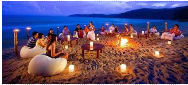
Goa expects floods of tourists for New Year

"We have been seeing very good numbers so far this year and demand has been encouraging in the months so far. Five-star hotels have done very