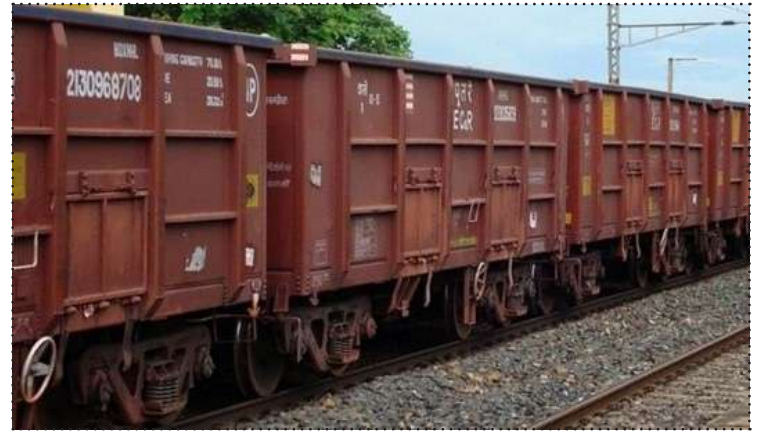
To prevent pilferages, Indian Railways to tag GPS on its wagons

While instances of wagons going missing are rare, considering the