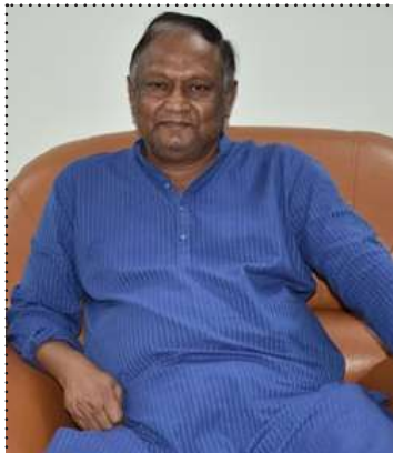
Bangladesh's commerce minister Tipu Munshi

During his two days visit starting December 22-23,