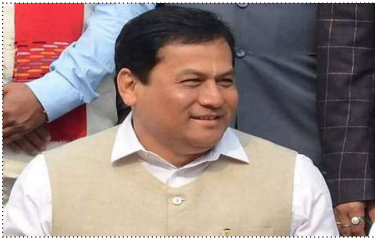
Shipping Minister Sonowal

This information was given by the Union Minister for Ports, Shipping and Waterways, Sarbananda Sonowal in a written reply