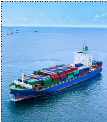
Mediterranean Sea Emission Control Area for Sulphur Oxides and particular matter

year," said IMO Secretary-General Kitack Lim, at the close of the MEPC 79 session, which met 12-16 December at IMO Headquarters in London.