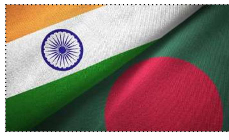
Both sides agree to discuss CEPA early

Discussion between Commerce Ministers of India and neighboring Bangladesh took place after long gap of four years. The last meeting was held in Dhaka way back in September 2018