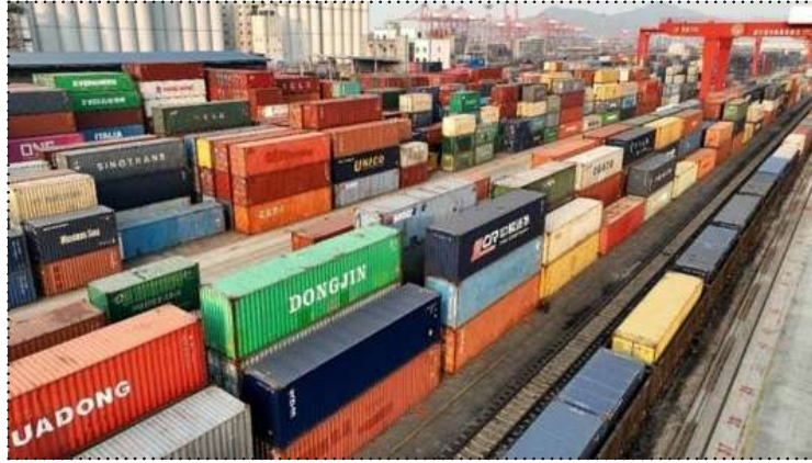
Now, volumes slackening and freight rates tumbling, carriers cut capacity and lay up vessels for an extended period.

Sea-Intelligence notes sees forecasting at least 11 a production slowdown in Asia. The shipping lines blank sailings in order to bring supply in line with demand. The industry has already begun blanking sailings with the expectation that it will continue and likely increase in the coming weeks. The Port of Los Angeles for example was