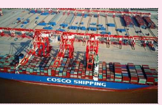
The opening ceremony was successfully held at COSCO SHIPPING Heavy Industry in Yangzhou, China