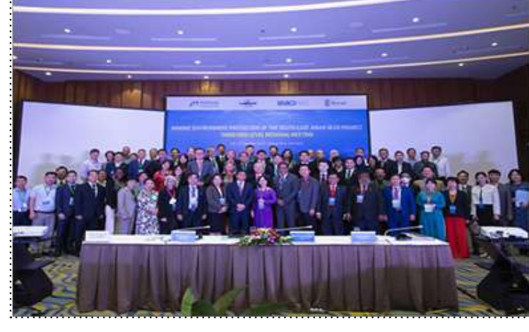
The MEPSEAS project culminated in the Technology Conference in Singapore

The Marine Environment Protection of the South-East Asian Seas (MEPSEAS) project has seen seven partner countries - Cambodia, Indonesia, Malaysia, Myanmar, Philippines,