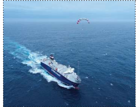
The roll-onroll-off ship Ville de Bordeaux trials Airseas' new "Seawing" automated kite system during a transatlantic voyage between Europe and the United States in December 2022.