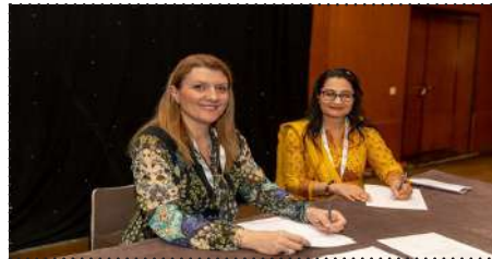
WISTA International and the Maritime SheEO announced the start of the formal partnership in November initiating the second Maritime SheEO Leadership Accelerator Programme