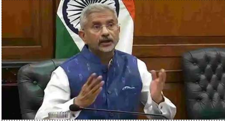
External Affairs Minister S Jaishankar

Addressing a business event organised by the High Commission of India in Cyprus, Jaishankar said New Delhi and Nicosia had a lot of potential to increase the bilateral trade between the two countries.