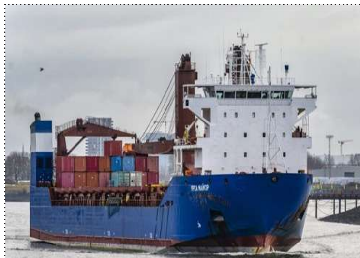
Russian ship URSA MAJOR denied entry by Bangladesh govt.

URSA MAJOR remains at anchor as of Dec 29, with status "Waiting for order".