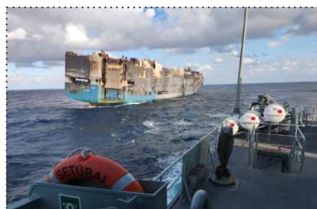
Felicity Ace badly burned and listing. Felicity Ace sank on March 1, 2022-220 nautical miles off the Azores 2 weeks after suffering fire and developing starboard list while carrying 4000 vehicles.