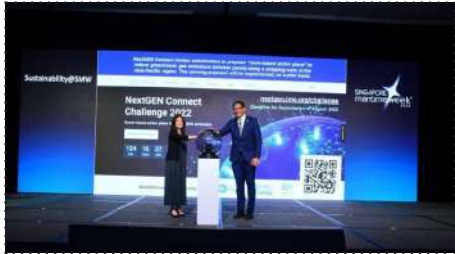
MPA Singapore and IMO jointly launched NextGEN Connect- a database which aims to bring stakeholders and academia and global research centers together to offer solutions on maritime decarbonization