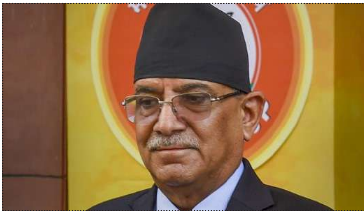
Nepal Prime Minister Pushpa Kamal Dahal Prachandra

adding "more Nepali products will be exported to China."