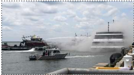
Tugboats spray water on the Spirit of Norfolk passenger vessel after a fire broke out near Naval Station Norfolk in Norfolk, Virginia, June 7, 2022. The sightseeing vessel was on a cruise on the Elizabeth River near Naval Station Norfolk when it caught fire with 108 people on board, many of whom were school children on a field trip.