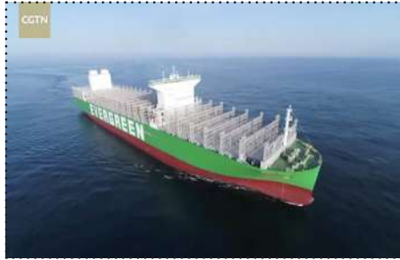
MV Ever Alot. The ship, with a carrying capacity of 24,004 TEU, was delivered by China's Hudong-Zhonghua Shipbuilding in June, becoming first ship in the world to crack the 24,000 TEU mark.