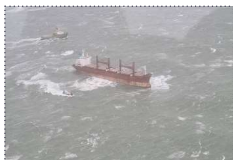
Photo showing the Julietta D abandoned and adrift off the Dutch Coast. The bulk carrier was rescued after a dramatic 24-hour rescue and nearly running aground during Storm Corrie in late January