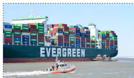
A 45-foot Response Boat-Medium underway alongside the grounded container ship Ever Forward in the Chesapeake Bay. The 1,095-foot ship grounded back in March outside the main shipping - stuck over month