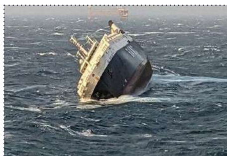
The Emirati ship Al Salmy 6 is seen sinking 30 miles from Assaluyeh in the Persian Gulf, Iran, March 17, 2022.