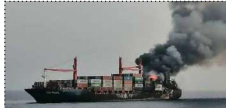
The Panamanian - flagged containership TSS Pearl burns before sinking in the Red Sea in October. All 25 crew members abandoned ship and were picked up by other ships in the area.