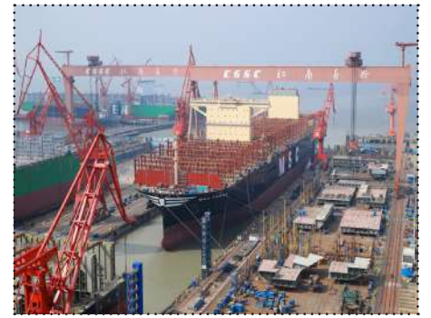
MSC Tessa under construction at Hudong-Zhonghua Shipbuilding. With a carrying capacity of 24,116 TEU, MSC Tessa will surpass Evergreen's Ever Alot by 112 TEU to take the title of world's largest Con.