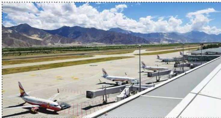
Saidpur airport to boost connectivity with Nepal and Bhutan.