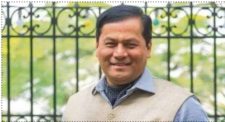
Shipping Minister Sonowal

With giant strides taken by the government for modernisation and capacity building in the maritime sector, India can be among the top ten countries in the global ranking of maritime merchandise trade, said Mr Sarbananda Sonowal, Union Minister for Ports,