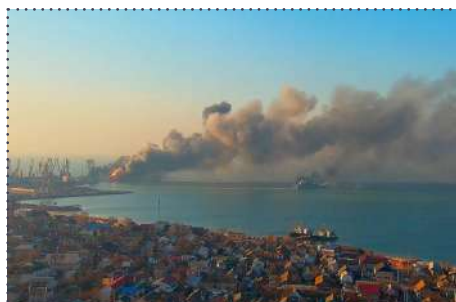
Smoke billows from a fire on what Ukrainian Ministry of Defence says is a Russian ship, as Russia's invasion of Ukraine continues, at the port of Berdiansk, Ukraine, March 24, 2022