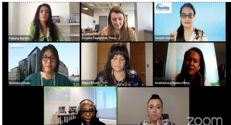
On March 8th IMO in collaboration with WISTA International and Maritime SheEO announced launch of the Maritime SheEO Leadership Accelerator Programme 2022