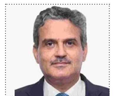
Dr Sanjeev Ranjan, Secretary for Ports, Shipping and Waterways.

Exchanges between the UAE and India, including support for the UAE's digitisation and single window initiatives, are in the context of preparing the new Strategic Plan, as per a report.