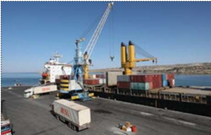
Shahid Kalantari terminal

India has taken two terminals in Chabahar port on a long term lease and had called it a strategic deal. With the Chinese