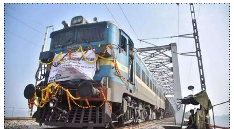
Freight train trial run

With the commissioning of this DFC detour, all the