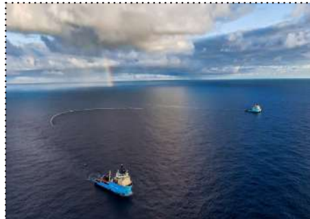
The Ocean Cleanup's System 002 deployed in the Great Pacific Garbage Patch. The largest and most ambitious ocean cleanup project in history in July by removing its first 100,000 kg of plastic.