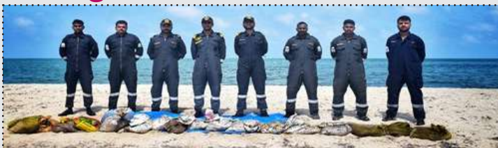
Coastguards seize sea cucumber off Pamban coast