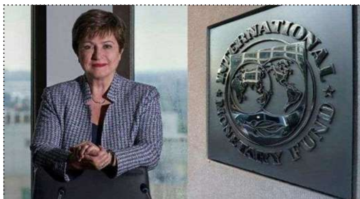
Kristalina Georgieva, the chief of the International Monetary Fund (IMF)

the wake of the ongoing conflict in Ukraine showing no signs of abating after more than 10 months, with spiraling inflation, higher interest rates and the surge in coronavirus infections