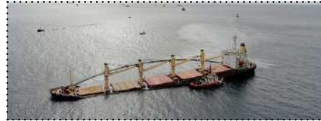
A view of the half-sunk cargo ship OS 35 in Catalan Bay after its collision on Wednesday with an LNG tanker near Gibraltar, September 1, 2022. The bulk carrier partially sank and later broke off.