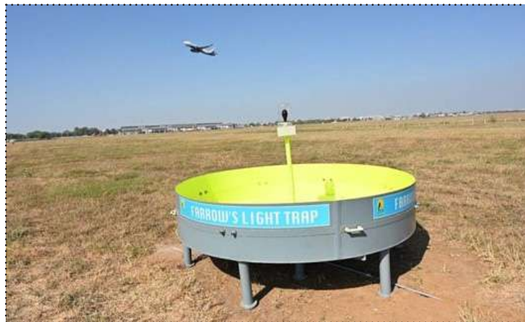
The FLT is also FLT to check bird movement at the airport

introduced FLT, reducing the movement of birds, according to a release from the Adani group which manages the airport. "This system mainly restricts and reduces activity for birds like Rosy Starlings, Mynas, Swallows, and Swifts. These are primarily large flocking birds seen at SVPIA," the statement said.