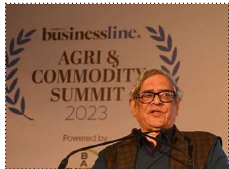
Bibek Debroy, Chairman, Economic Advisory Council to PM, at the businessline Agri-Business and Commodities Summit in New Delhi

Indian farmer should be made free from state interventions for transforming the agriculture sector,