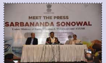
Union Minister of Ports Sarbananda Sonowal announced major initiatives planned for Assam by the Ministry of Ports this year

Union Minister of Ports Sarbananda Sonowal announced major initiatives planned for Assam by the Ministry of Ports this year for the development of inland waterways in Guwahati