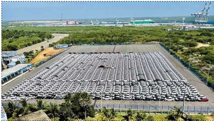
New RORO business to Hambantota Port in 2023

Sri Lanka's Hambantota Port's RORO numbers, which is expected to