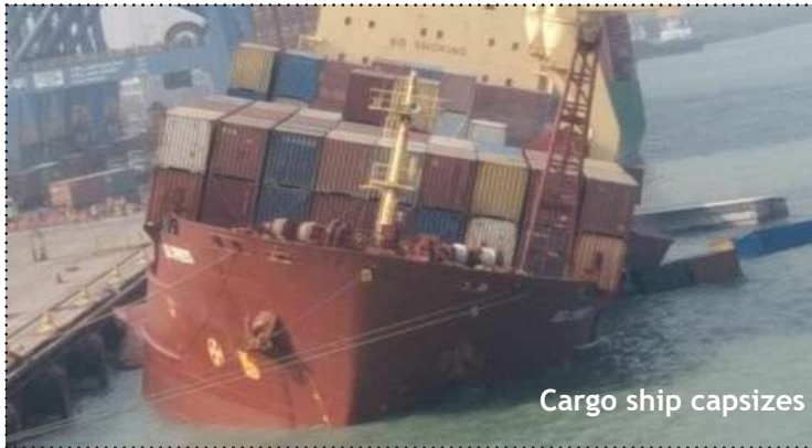
Cargo ship capsizes