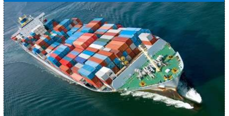
The liner bonanza isn't over yet

Changes in operating fleet size during the COVID era are only part of the story. Another is the orderbook. Ocean carriers used profits from the consumer boom to contract a massive wave of new ships for delivery in 2023 and beyond.