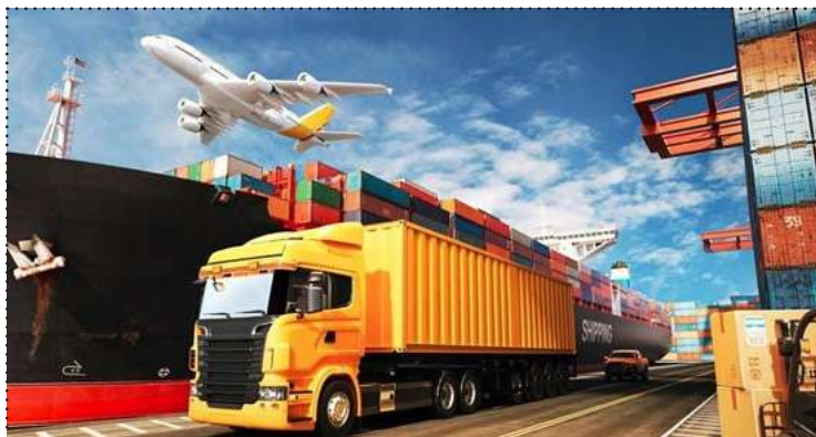
Important assets mapped for optimum use of PM Gati Shakti

along with Gati Shakti's vision has improved the quality of planning of projects and infrastructure in the country, thus helping in cost optimization and also saving time.