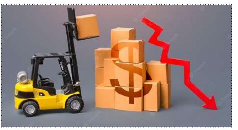
Decline in imports from China by 6% in Nov 2022

The decline in imports from China comes at a time when the neighboring country saw a spike in Covid-19 cases and strict