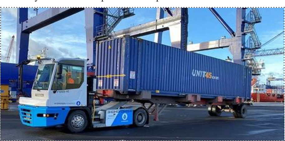
The first hydrogen-fuelled tractor will be used at the container terminal at the Port of Immingham in the United Kingdom

UK's maritime minister, Baroness Vere stated, "Decarbonising the maritime sector goes beyond cutting emissions at sea, and this trial demonstrates that hydrogen will play a significant part in UK's port operations and shed their dependence on fossil fuels."