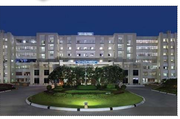
SRM Institute of Science and Technology

will promote academic research in cooperation, enhance scientific understanding of technologies related to defense and encourage