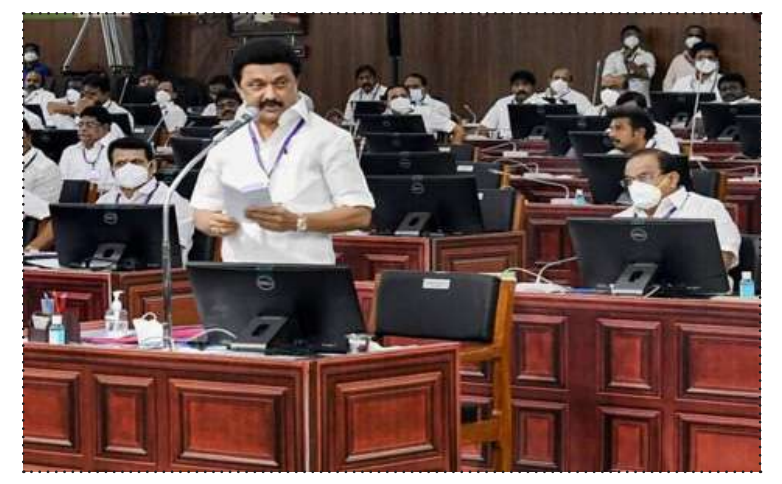
TN CM M.K. Stalin urged the Centre to implement immediately the Sethusamudram project.

In an unexpected move, BJP floor leader Nainar Nagenthran said he would support the project if it is implemented without damaging the Rama Sethu, believed to have been built by Lord Rama. The PMK and the allies of the DMK - Congress, VCK, CPM, CPI, MDMK, KDMK, MMK, and TVK supported the resolution.