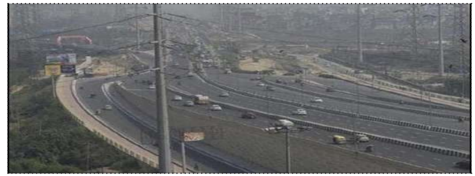
Vehicles pass through National Highway 24 amid thick smog in New Delhi. Road safety becomes more difficult with thick smog