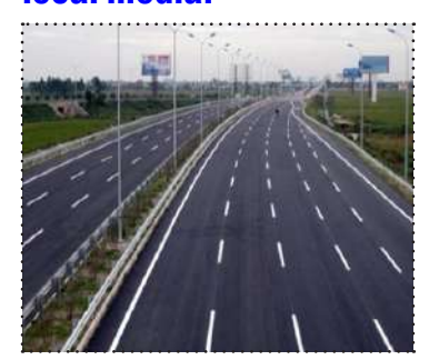
8 Lane expressway

expressway within a year, an official was quoted by local media.