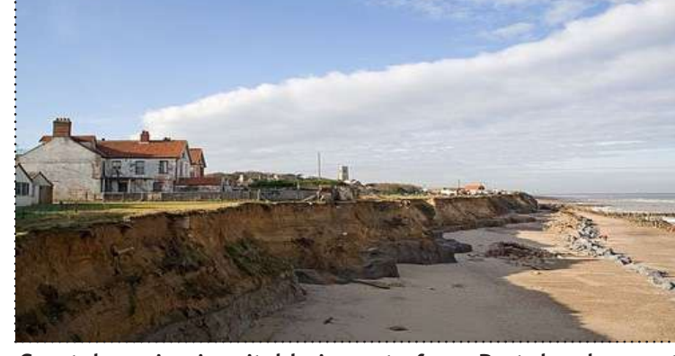
Coastal erosion inevitable impact of any Port development says an expert

But they decided to appoint the four-member expert committee to pacify the protesters who had obstructed the construction of the port during the second half of 2022. However, coastal experts have long urged for a comprehensive