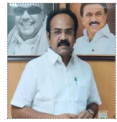
Industries minister Thangam Thennarasu

amil Nadu government has asserted that the Union Port ministry should end its neglect of Southern Ports and develop VOC Port Tuticorin as a Transshipment hub to handle bulk cargo and containers. The demand comes in the wake of shipping the ministry with the proceeding construction of mega transshipment hub at Nicobar islands virtually