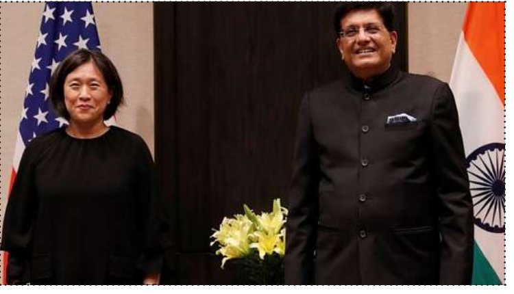
India -US bilateral trade

The Ministers welcomed the finalization of the Turtle Excluder Device (TED) design. The collaboration interest in restoration of its