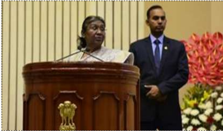
President of India Smt. Droupadi Murmu conferring Pradhan Mantri Rashtriya Bal Puraskar-2023