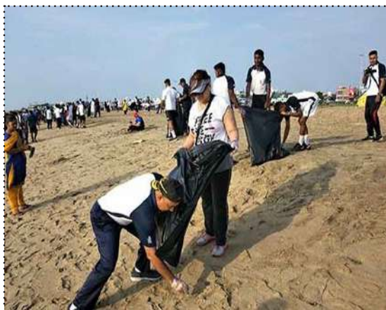
Indian Navy cleans up TN beaches for a clean beach, clean sea.

The aim of the campaign is to increase public awareness about