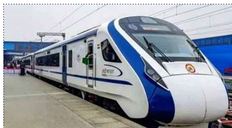
Vande Bharat trains

The formal announcement regarding the launch of the Bengaluru-Hyderabad Vande Bharat