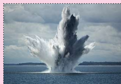
Australia eyes sea mines to shore up maritime defense