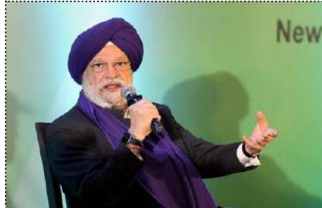
Minister for Petroleum and Natural Gas Hardeep Singh Puri

OMCs have incurred a loss of ₹21,200 crore on account of selling petrol and diesel below the cost price. Though the companies are free to revise the product prices based on economics, but in practical