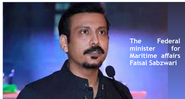
The Federal minister for Maritime affairs Faisal Sabzwari

An estimated 8,000 containers are stuck at the ports.