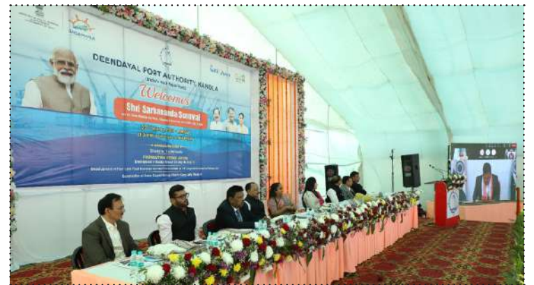
Delegates who had attended the event

Deendayal Port Authority is the largest liquid handling port in the country. It handles all kinds of liquid bulk i.e. petroleum products, petrochemicals, acids, liquefied gases and vegetable oils. Keeping the future vision and port