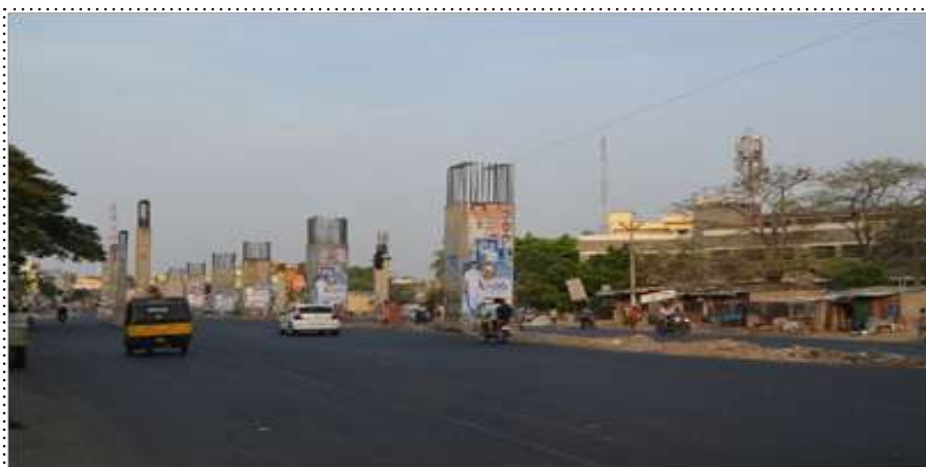
Chennai - Maduravoyal corridor delayed for years

Chennai port due to congestion. But the shipping ministry is yet to act to ensure that work resumes.