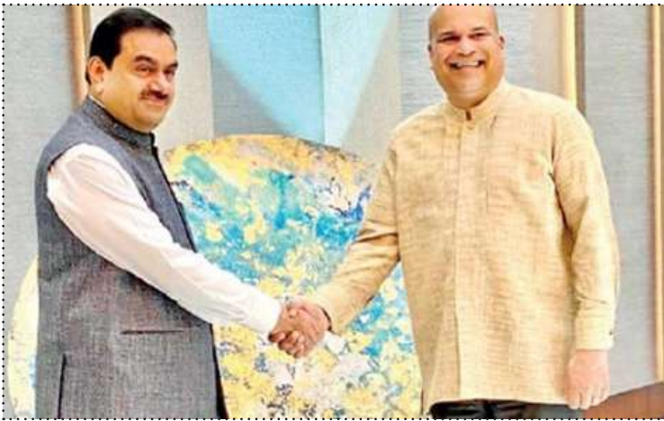
Gautam Adani and Sri Lanka's High Commissioner to India Milinda Moragoda