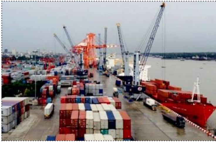
The new Sittwe Port started construction in 2009 funded by India, and will be leased by the Indian Government for 30 years under the BTO system

The port is a part of the Kaladan Multi-Modal Transit Transport Project, which will be important in the trade sector between Myanmar and India. Now that all the construction work has been completed,