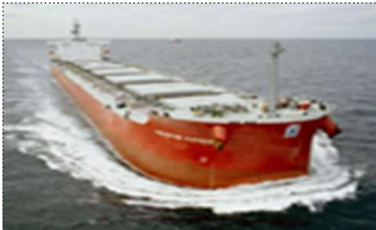
The overall index fell 19 points, or about 2.6%, to 721, its lowest since early-June 2020.

The overall index, which factors in rates for capesize, panamax and supramax shipping vessels, fell