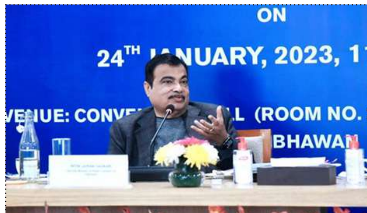
Shri Gadkari said an action plan has been introduced to accelerate Gati Shakti scheme's progress.

projects. These included of working permissions/ issues related to pending approvals, ensuring forest and environment land allocation/transfer clearances, facilitation and release of funds.