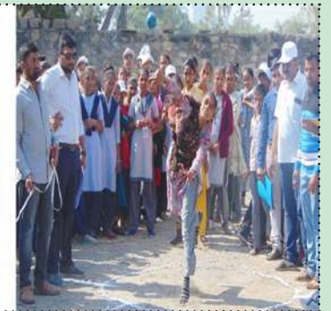
APMT Pipavav encourages sport as a means for fit and healthy life

APM Terminals Pipavav provides a platform and eco system for overall development of the youngsters through various initiatives. It nurtures the healthy competition and sportsmanship by facilitating the youth to come together and compete in various competitions. Such events motivate the students not to just stay fit and healthy but also inspire them to choose sports as a career.