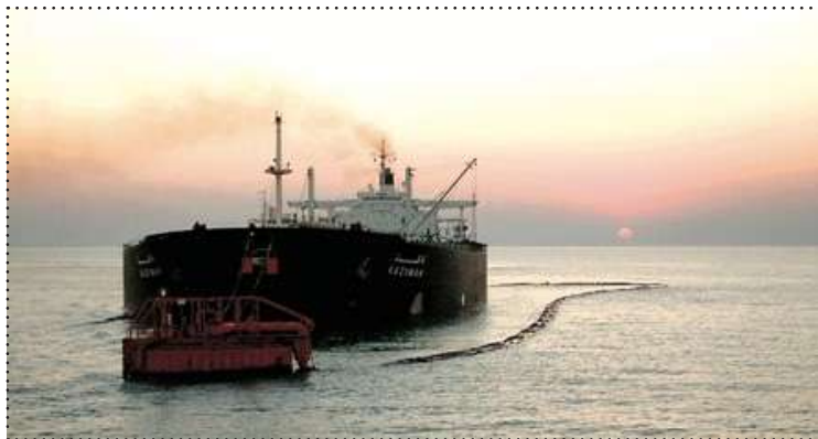
DPA Kandla creates new record in handling cargo