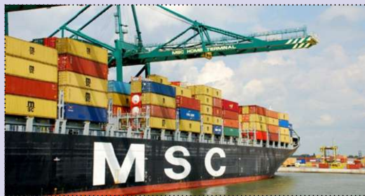
MSC scrubber champion for 2022

On the other hand, DynaLiners notes that