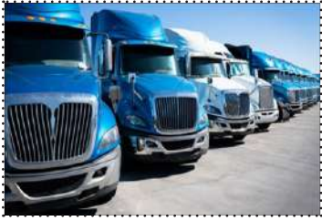
40 tonne E-trucks