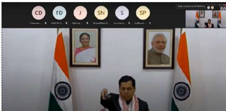
The Union Minister Mr. Sarbananda Sonowal inaugurated the Oil Jetty No. 7

Shaped Storage Shed inside CJ area Phase II - with an estimated investment cost of ₹39.66 crores. All these projects are scheduled to be completed by 2024.