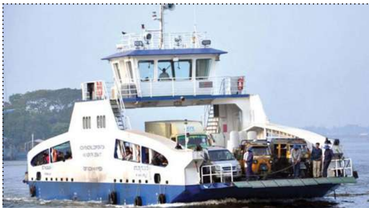
Passenger ferry halted as people demanded the service till Vypeen.

The container Ro-Ro of KSINC, Adi Shankara , was deployed for regular service in the absence of passenger vehicle Ro-Ro Sethusagar-1 , which has been out of service for the last two months. However,