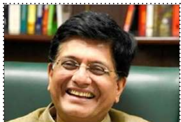
Piyush Goyal, Commerce & Industry Minister

As issues get flagged off, the government does its inter-ministerial consultation and, wherever