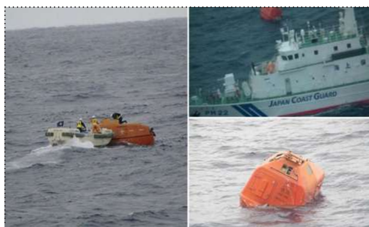
Thirteen crew rescued after ship sinks off Japan, search on for 9 missing

were battered by winter storms that brought freezing, windy conditions. The area where the ship sank is between Nagasaki