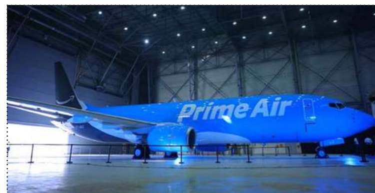
Interestingly, even though the service is known as Amazon Air, the planes continue to bear the Prime Air insignia

Since Amazon has more than five million Amazon Prime subscribers and India is one of the company's largest and fastest-growing international markets, the newest expansion of its services in the country seems like the next logical step. The business has