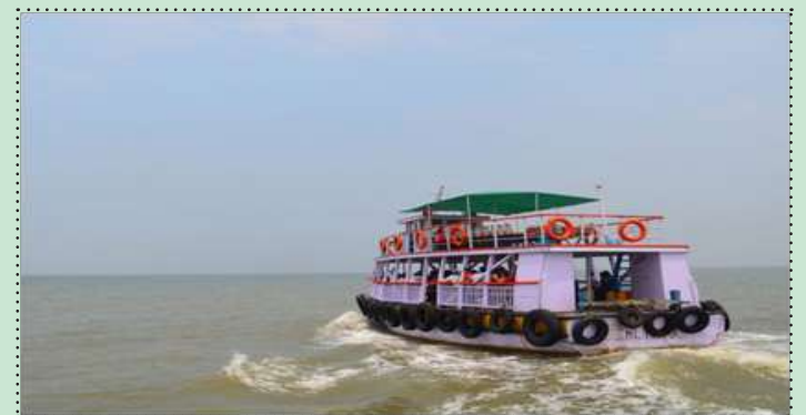
Boat in Varanasi