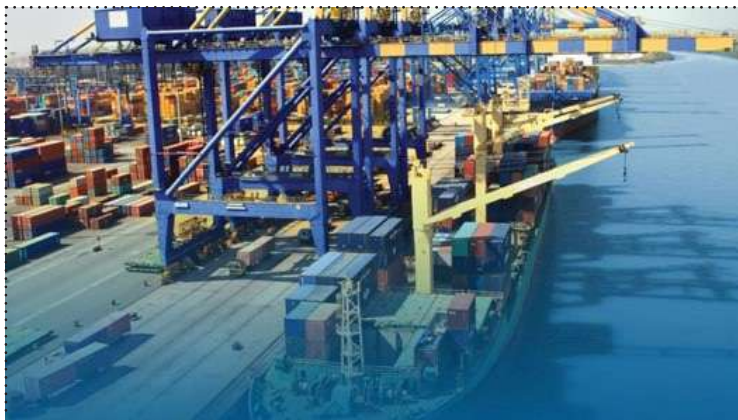
Cargo traffic at state-owned ports rose 10.4 per cent in December year-on-year

It is also the second-highest traffic volume handled by major ports in a month since the onset of Covid-19. Cumulatively,