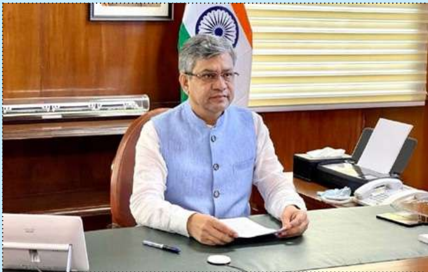
Railways minister Ashwini Vaishnav