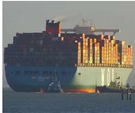
The MOL Treasure pictured in the Solent, January 26, 2023.

incident in a statement posted to Twitter. The ship departed the Port of Southampton around 1100 local