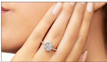
Lab Grown Diamond ring

Presenting the Budget on February 1st Finance Minister Nirmala Sitharaman, said, ". To encourage indigenous production