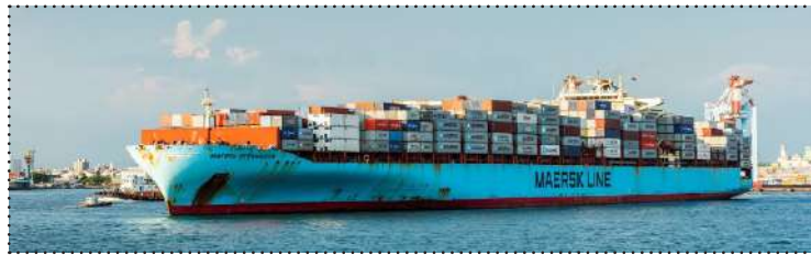
These services will replace the existing Cobra and Komodo services

“Ocean transport is key to the Australian