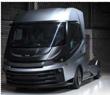
Autonomous Heavy Goods Vehicle (HGV)

HVS's announcement also comes more than a year after Ford UK tested autonomous vehicles at London Gateway to observe how autonomous delivery can impact operations and workflow at ports.