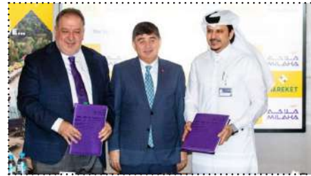
Milaha and Hareket sign a Strategic Alliance

global Turkish company Hareket signed an agreement to establish a strategic alliance to provide a huge and integrated range of transportation and heavy lifting services in the State of Qatar.