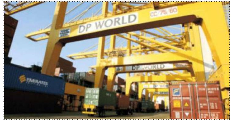
TFX will call at two DP World terminals - Laem Chabang and Fremantle Terminal

Over the next 12 months, the terminal will introduce new equipment such as quay cranes, reach stackers, forklifts, internal transfer vehicles, as well as