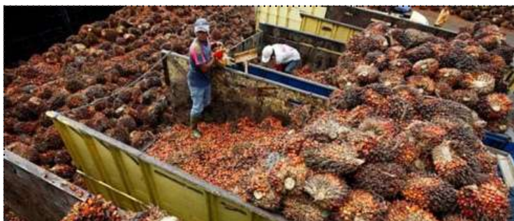
India's January palm oil imports fell 31% from a month ago to their lowest

imports fell to 770,000 tonnes last month, the lowest since July 2022, according to the average of the estimates from the five dealers with trading firms.