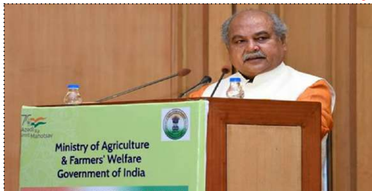
Union Minister of Agriculture and Farmers Welfare, Shri Narendra Singh Tomar