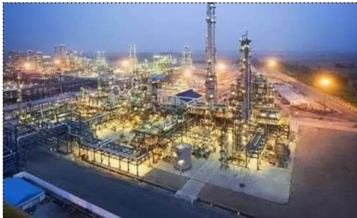
The LPG import terminal, coming up on Puthuvype Island, is expected to be commissioned soon.

He added that the terminal would meet the entire LPG requirement of Kerala. Work on the terminal is in full throttle, and Phase I is nearing completion. The construction of the multi-user liquid jetty of the project with 1.2 million