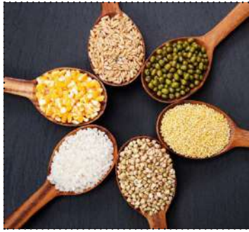
Millets make healthy food

The Buyer Seller Meet was organized in association with Indian Mission in UAE headed