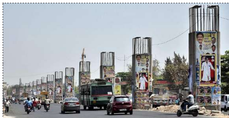
Maduravoyal elevated corridor

speedy evacuation of containers was suspended due to political animosity way back in 2011 by the Aiadm government. The Tamil Nadu Government however gave green signal for resumption of work in the project in 2016. Various central agencies starting from the Indian Navy, Environment Ministry, Changes in design suggested by State Government and the Railways have been blocking a crucial infrastructure projects for the past Seven years.