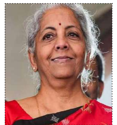
Finance Minister Nirmala Sitharaman.

The finance minister had announced a revamped credit guarantee scheme to provide MSMEs with more collateral-free credit. MSME credit guarantee.