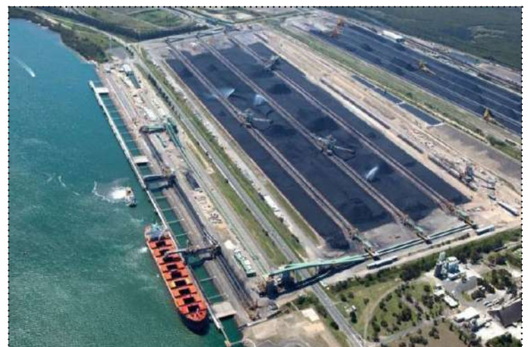
Newcastle Coal Infrastructure Group

China and Australia's top trade officials are due to meet next week where more details of the coal trade will likely be revealed.