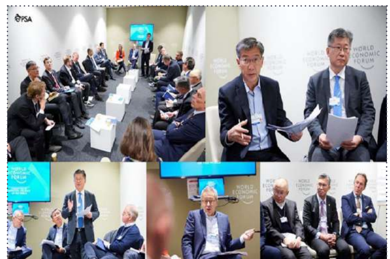
The World Economic Forum (WEF) Supply Chain and Transport (SCT) Governors Meeting and Policy Session in Davos, Switzerland

At the end of the session, the Governors agreed to ramp up efforts across a number of areas moving forward – to increase engagement with the public sector on data collaboration;