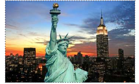
United States has emerged as India's top destination for Merchandise Exports during April-December this fiscal

According to the data provided by the minister in his reply, United States was followed by UAE (23.31 billion US dollars); Netherlands (14.1 billion US dollars); China (11 billion US dollars); Singapore and Bangladesh (about 9 billion US dollars each).