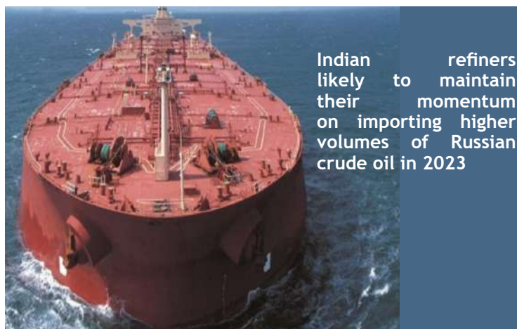
Indian refiners likely to maintain their momentum on importing higher volumes of Russian crude oil in 2023

A senior government official said that Russia is increasingly moving towards its new major consumers, China and India. On the other hand, Europe is moving towards Middle East for crude oil and the US and India for refined oil products.