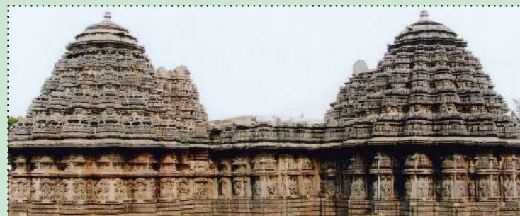
Karnataka got a record allocation of Rs 7,561 crore in the Railway budget 2023-2024

for redevelopment," he said. 16 of these stations are in Bengaluru Railway Division.