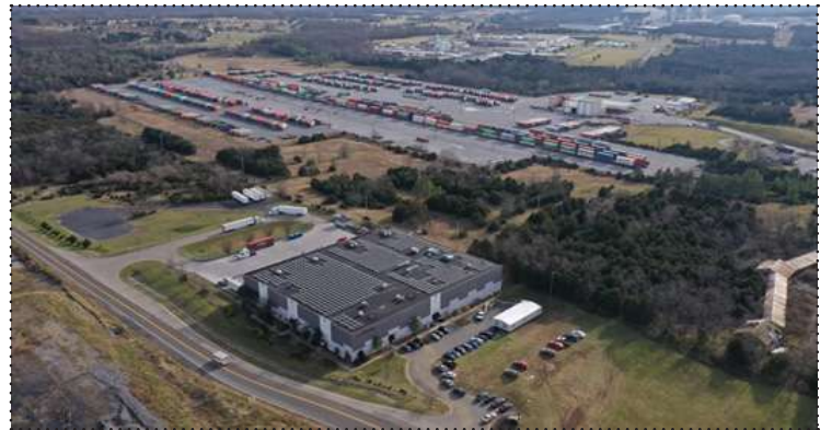
Port of Virginia aims to become carbon-neutral by 2040