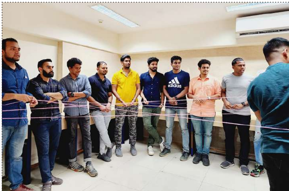
Gender Sensitisation, training in progress

Gender is evident in the roles, responsibilities, attitudes and behaviours that society expects and considers appropriate, independent of an individual's own identity or expression. Societal and individual expectations about gender are learnt and changeable over time. They