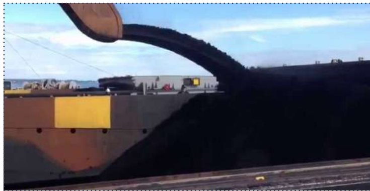
Goa Allows Import of Ore for Export from Mormugao Port, a revenue generation measure

"No person or company or firm other than an end-user or leaseholder registered under sub-rule (1) of rule 45 of the Mineral Conservation and Development Rules, 2017, shall be allowed to import mineral from any state or Union territory within India