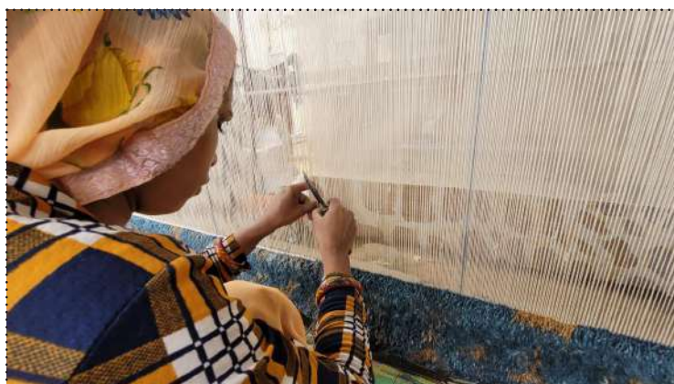
An artisan at work. It takes three months for a carpet to be made

Today, nearly 20 per cent of the ₹770 crore company's business comes from India and almost 9 per cent is through retail sales. The magic formula was to take the creative dignity