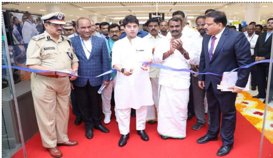
Civil aviation Minister Jyotiraditya M. Scindia, inaugurated the Domestic to Domestic transfer facility at Chennai Airport on February fourth.

The Civil Aviation Minister interacted with the first passengers accessing the domestic to domestic transfer facility. The passengers who used this facility complimented the Minister and AAI for the efforts and requested for many such measures increasing convenience of passengers.