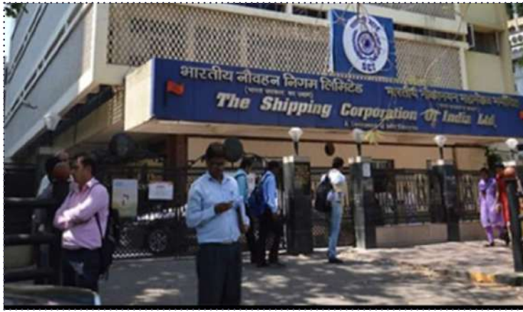
SCI posts stellar results for the third quarter (Oct.-Dec.) of 2022-23

The company also recorded the highest nine-monthly operating revenue,