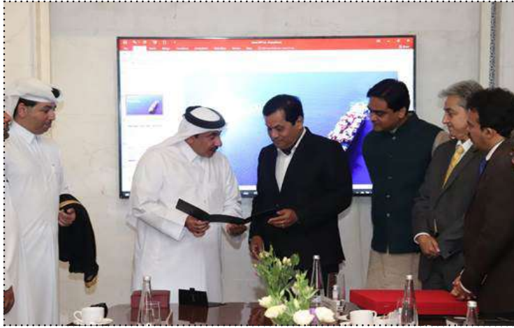
Ports minister Sonowal third from the left and Qatar counterpart second from the left

India - Qatar cooperation in diverse sectors has been steadily growing in an excellent