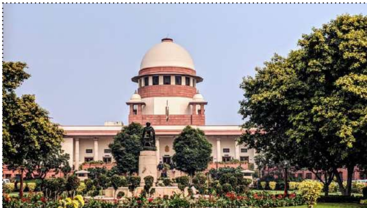
SC upholds NGT order to demolish oil storage tank of Adani Group's JV

The apex court, however, provided two reliefs to the Adani Company. One was the venture got six months time to demolish the storage