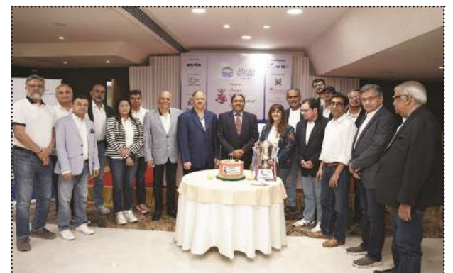
AMTOI Cricket Tournament Season 3

As reported earlier, the winners of the tournament were as follows: