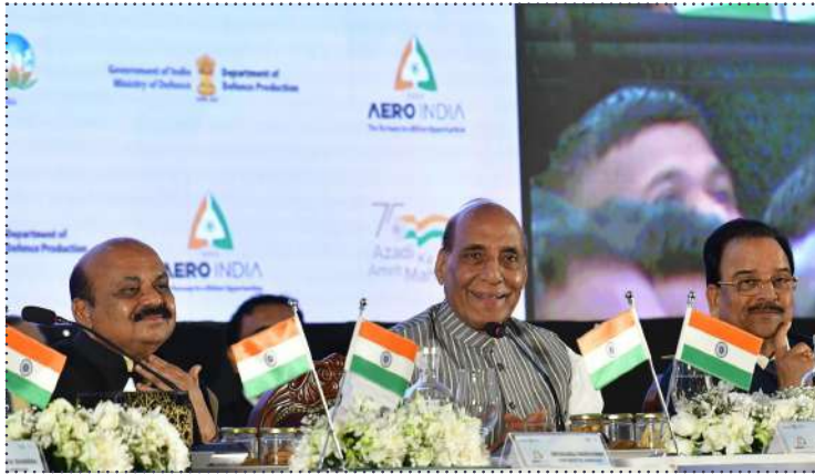
Union Defence Minister Rajnath Singh, Union Minister of State for Defence Ajay Bhatt (right), Chief Minister Basavaraj S Bommai (left), at curtain raiser press conference ahead of AERO INDIA - 2023, Bengaluru Airshow, in Bengaluru on February 12, 2023.

Addressing media on the eve of Aero India, Defence Minister Singh stated that we envisioned the aero show to be a big event, but it has taken shape of an even more grand event. With participants from around 100 friendly countries and 800 exhibitors, this