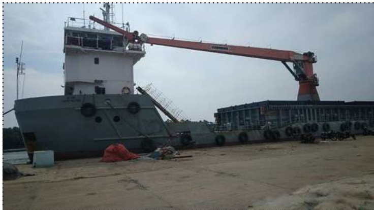
Container ship berthed at Puducherry port

When the container terminals in Gujarat and JNPA were flourishing, Chennai port which pioneered container facilities way back in 1980, it looked like a dead end. Mega container project proposed by the Chennai port had no takers. Tenders