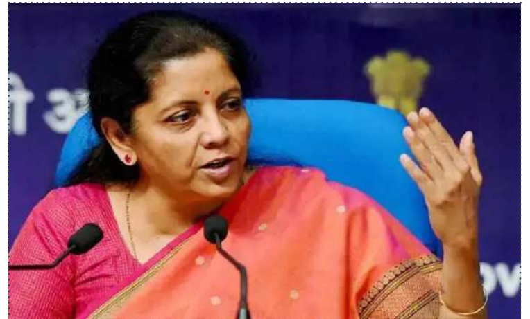
FM Nirmala Sitaraman: India's regulators are very, very experienced and they are experts in their domain

A bench headed by Chief Justice D Y Chandrachud also told Solicitor General Tushar Mehta to convey to the officials of the Securities and Exchange Board of India (SEBI) that it was not "planning any witch hunt". The apex court sought inputs from the finance ministry and others on various issues, including