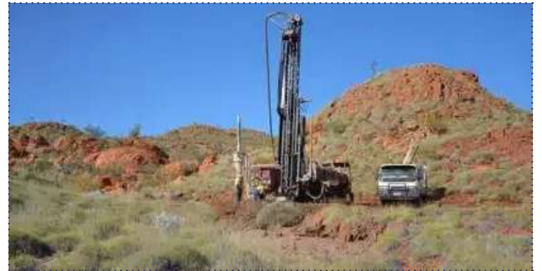
Lithium reserves found in J & K

Out of the total 51 mineral blocks, 5 blocks pertain to gold and other blocks pertain to