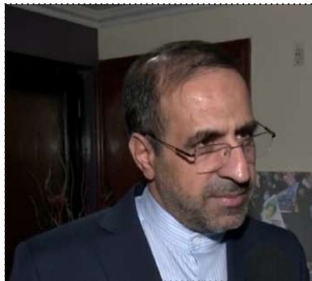
Iran ambassador Iraj Elahi: India is of special importance to Iran

While speaking on the occasion, Iran ambassador Iraj Elahi praised the relationship between India and Iran. "One of the results of the Islamic Revolution has been the strengthening of relations with neighbouring countries. India is of special importance to Iran. The recent cordial meeting between