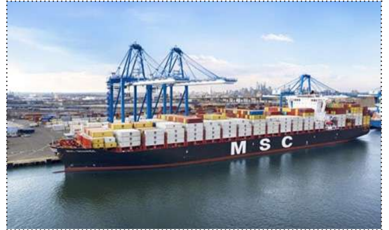
MSC has confirmed it has accepted a proposal to jointly fund a settlement with claimants relating to the 2021 Orange County pipeline oil spill.

The company noted that its investigation has revealed that the pipeline did not comply with its original permit to be built sufficiently away from the federal anchorage zone in which MSC Danit and other ships were anchored, and that the negligent conduct of Amplify Energy including its