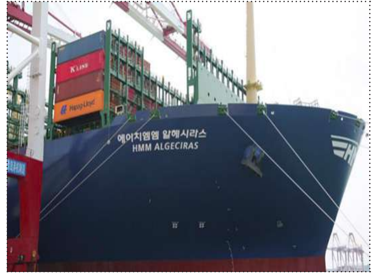
HMM one of the container lines subject to the FMC inquiry

Looking ahead the South Korean company said: "Unfavorable market conditions are expected to continue due to widespread inflation and weak economic growth, putting pressure on demand."