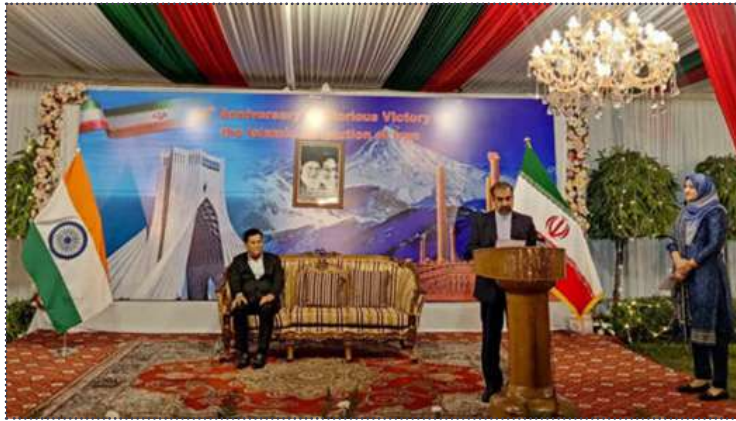
Iran Ambassador in India Iraj Elahi addressing the gathering while the Ports and Shipping Minister Sarbananda Sonowal is seated.

Chabahar port is considered as the golden