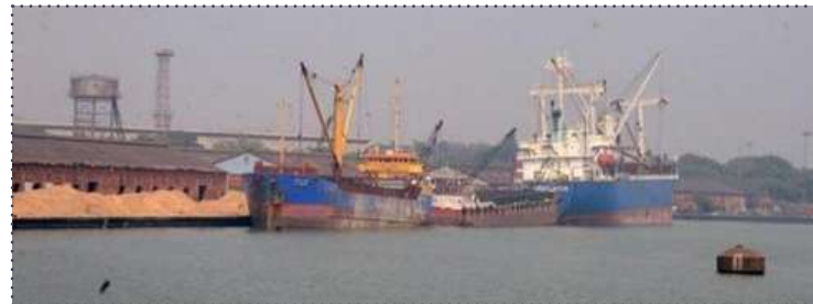
Adani Ports & SEZ Ltd (APSEZ) remains committed to Rs 15,000 crore deep-sea port project in Tajpur, West Bengal

The comments come against the backdrop of a crisis in Adani Group companies following a report by US short-seller Hindenburg Research published last month. Adani Group stocks have taken a beating on the bourses after Hindenburg made a litany of allegations in its