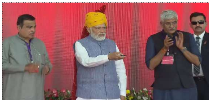
PM Modi commissioning 1 st leg of Delhi-Mumbai Expressway

with the Expressway. The project will connect the Expressway with Ambala-Kotputli corridor near Alwar. This will help vehicles coming from Haryana, Punjab, Himachal and Jammu Kashmir to travel to Punjab, Gujarat,