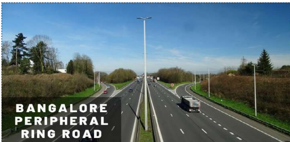
BANGALORE PERIPHERAL RING ROAD

Action is being taken to construct a 100-metre wide, eight-lane Peripheral Ring Road from Tumakuru Road to Ballari Road and Old Madras Road to Hosur Road. The Bengaluru Suburban Rail Project is in progress. The Bengaluru Metropolitan Land Transport Authority Act is being implemented by bringing together various organisations to reduce traffic.