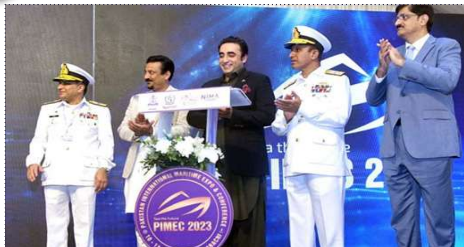
Foreign Minister Bilawal Bhutto inaugurating the ceremony of the Pakistan International Maritime Expo & Conference (PIMEC) in Karachi on February 10, 2023.

The current global security environment is full of enormous challenges and there is a need