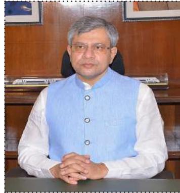
Railway Minister Ashwini Vaishnaw

In a written answer in Parliament the minister said the infra projects to a length of 636 kilometers involving an expenditure of around Rs 19,000 crores have been