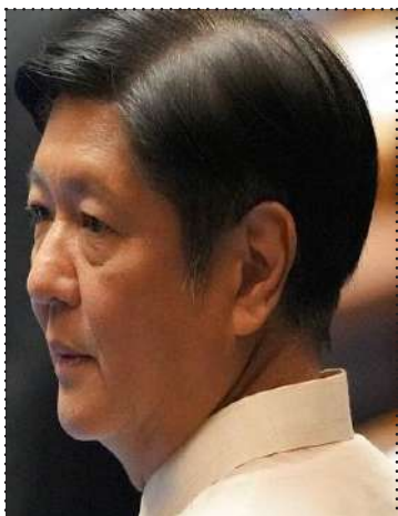
Philippines President Ferdinand Marcos