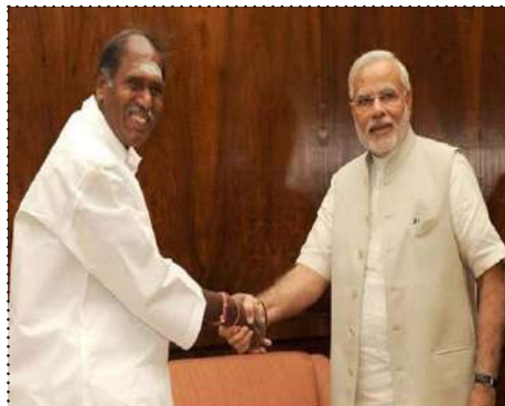
Puducherry Chief Minister N Rangasamy thanked Prime Minister Narendra Modi for seeking solutions to prevent erosion

An MSP is to ensure that human activities at sea take place in an efficient, safe and sustainable manner. The initiative will be implemented by the Ministry of