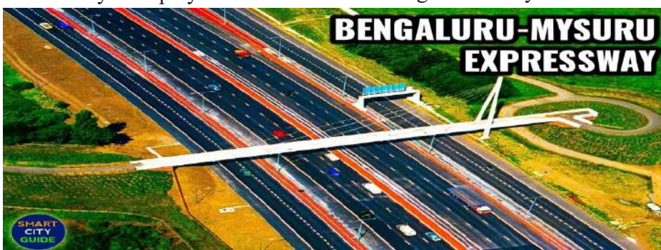
The toll price is yet to be finalised.

The expressway has five main bypasses including Srirangapatna bypass, Mandya bypass, Bidadi bypass, a 22-kilometre-long stretch that bypasses Ramanagara and Channapatna and the Maddur bypass. The bypasses have been constructed to avoid congestion on the Bengaluru to Mysuru route.