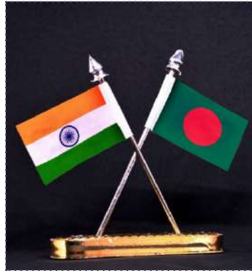
India and Bangladesh flags

Different trade related issues, including Comprehensive Economic Partnership Agreement (CEPA), lifting of