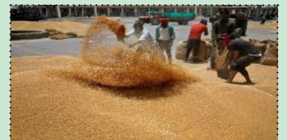
The record high production of wheat, rice and coarse cereals has resulted in foodgrains production projected at a new high of 323.55 mt

The estimates come at a time when core inflation remains high and speculations are rife over kharif rice production and the shaping up of the wheat harvest due in a month's time. Wheat and rice prices soared to record highs this year.