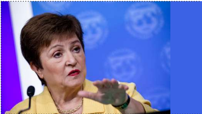
Managing Director Kristalina Georgieva: The world economy is still in a very difficult place