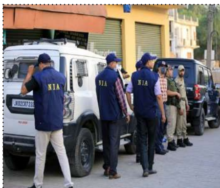
DRI officials seize about 12 kg of heroin and nab 3 persons involved.

Examination of baggage of the passenger resulted in the recovery and seizure of 11.94 kg of creamish