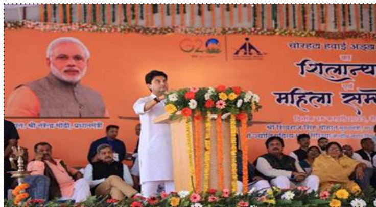
Aviation Minister Jyotir Aditya Scindia laying the foundation stone for Rewa airport

over the existing airport to the Airport Authority of India for the revival and construction of facilities to operate 19-seater aircraft.