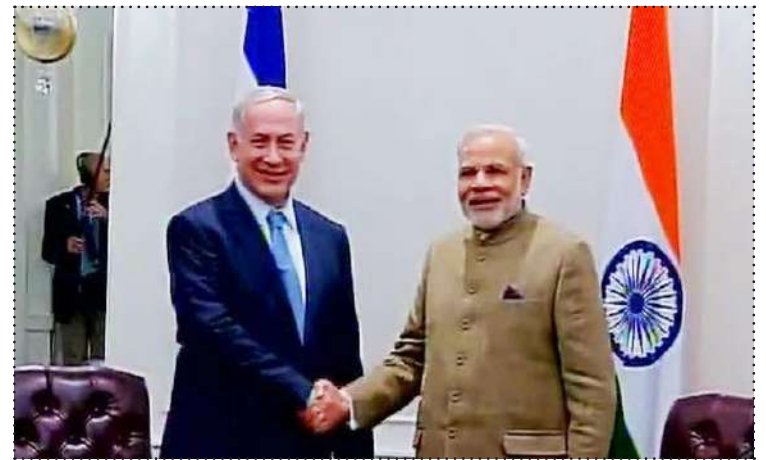
Israeli Prime Minister Benjamin Netanyahu with his Indian counterpart PM Modi

We believe that he will make this port stronger. He has paid all the money for the port." Shares of