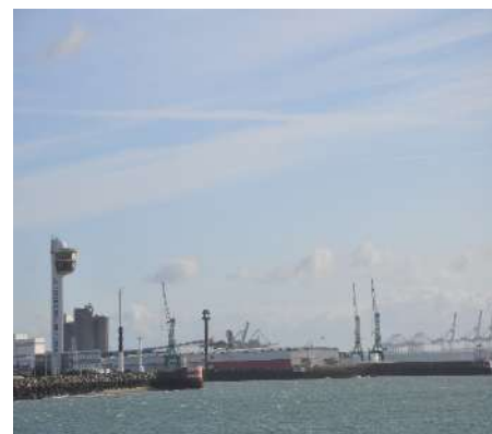
Le Havre port

There will be a strike at Bordeaux from 0001 to 2400 on February 16, but the petroleum terminals of Ambes and Pauillac will not be impacted.