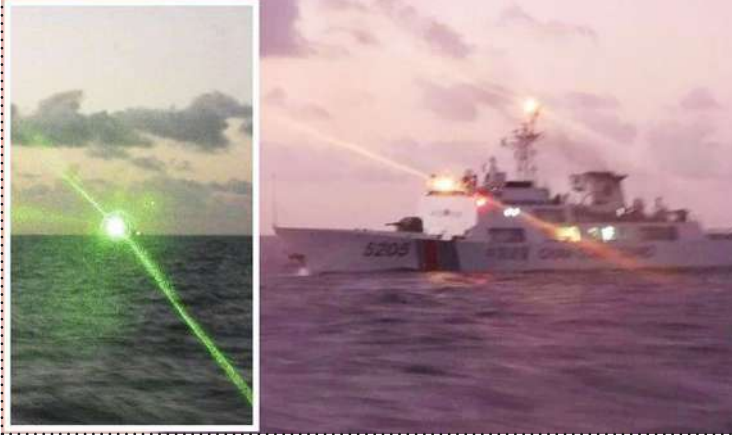
Philippines condemns China's aggressive use of laser against a Philippine patrol boat

There have been a series of maritime incidents between the Philippines and China, which claims