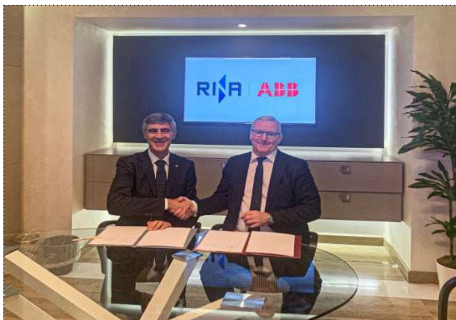
RINA & ABB

As the technology provider, ABB will focus on the development of suitable solutions based on the latest technologies, providing information on possible ways to increase fuel efficiency in existing systems, and presenting and discussing solutions with owners, designers, and shipyards. Source: RINA.