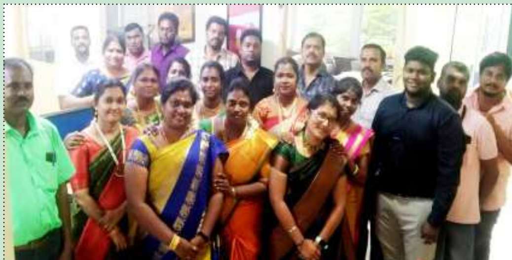
Vanguard Logistics Pvt Ltd., Team

Vanguard Logistics Pvt Ltd. is a global logistics provider, with a well-integrated network of offices & service centers providing customized logistics solutions globally. The Vanguard Logistics team is made up of individuals with a comprehensive background in all facets of international and domestic trade.