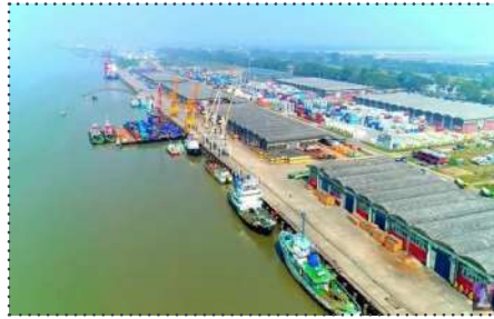
Mongla port, new battleground for India and China

India and China in quick succession have signaled that they were moving forward with the projects in the Port... China already has a significant presence in Bangladesh's ports and shipping industry, while India has transshipment facilities at two