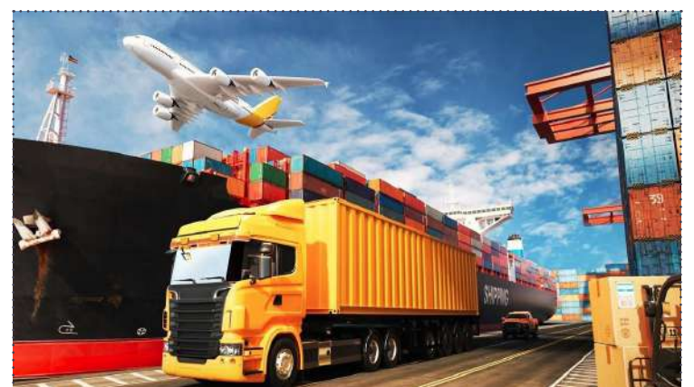
The Indian government approved Bangladesh's transshipment cargo to be handled at the Delhi Air Cargo complex

The alternative transshipment facilitation push, both for sea and air services, comes as the Bangladesh government and local exporters are looking to capitalise on global sourcing shifts away from China, with RMG goods leading that migration.