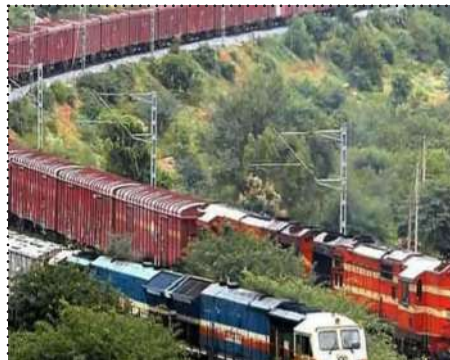
Long-haul freight train

reduce carbon footprints thereby saving cost to DLI as a rail operator and to the Indian Railways with optimum utilization of their resources.