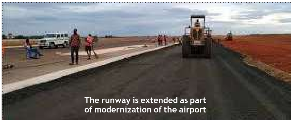
The runway is extended as part of modernization of the airport

The Tuticorin airport functioning at Vagaikulam is being modernized at an estimated cost of Rs 380 crore.