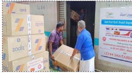
Joint parcel service by Railways and Dept of Post

The highlights of this service are Total logistic Service: Pick-Up and Delivery at customer premises, Palletization -Transportation through covered and sealed boxes, Semi-mechanized handling, Time tabled service, Insurance at 0.05% of the declared value of the cargo