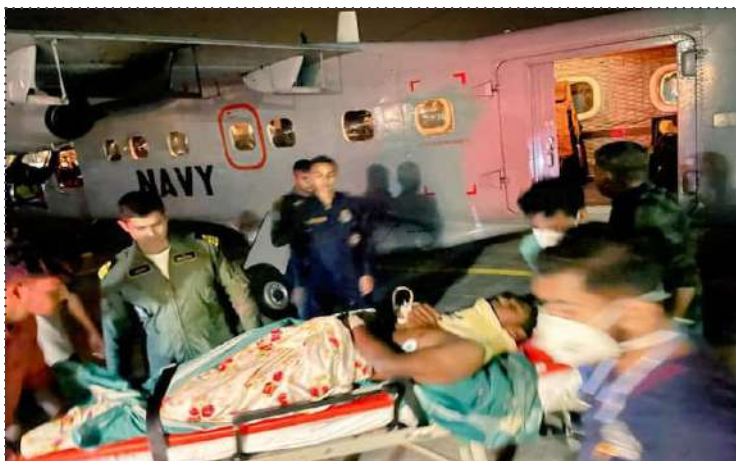
Indian Navy Dornier aircraft at midnight evacuation from Lakshadweep