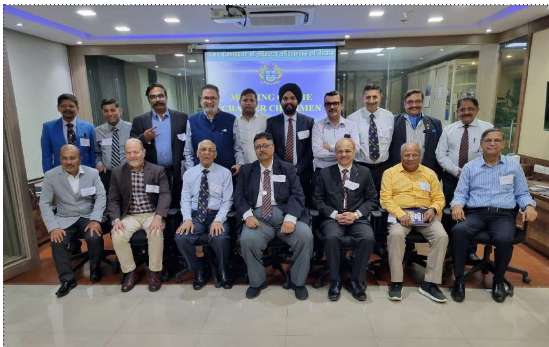
Meeting with CMMI Chapter Chairman Pan India