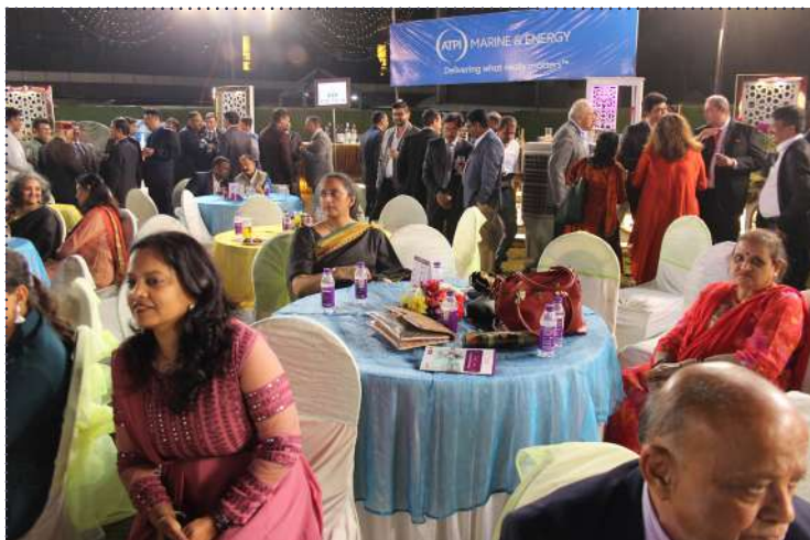
Guest enjoying evening