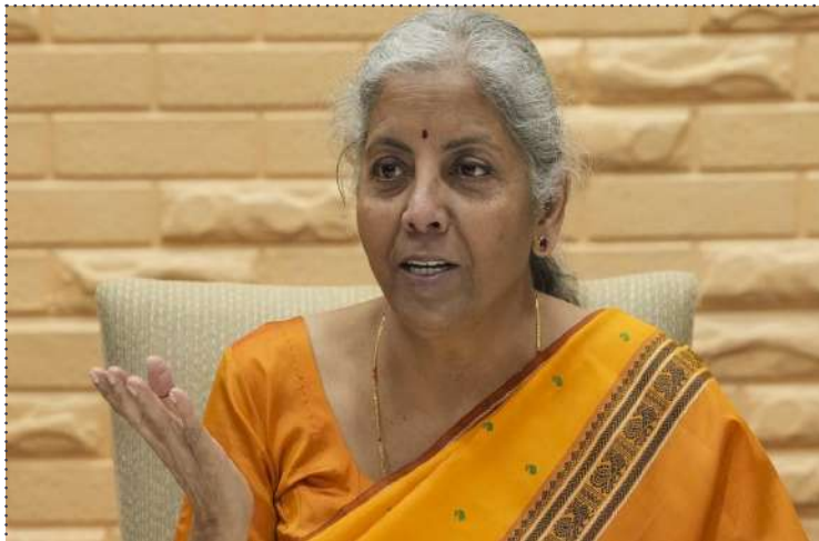
FM Nirmala Sitharaman : Slowing economy abroad is going to be challenge for Indian exporters

Both countries also agreed to extend reciprocal support to each other's upcoming candidature for Non-Permanent membership of the UN Security Council.