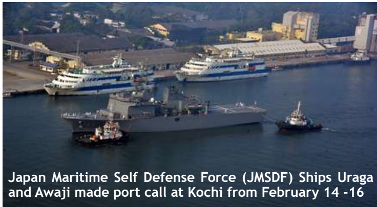
Japan Maritime Self Defense Force (JMSDF) Ships Uruga and Awaji made port call at Kochi from February 14 -16