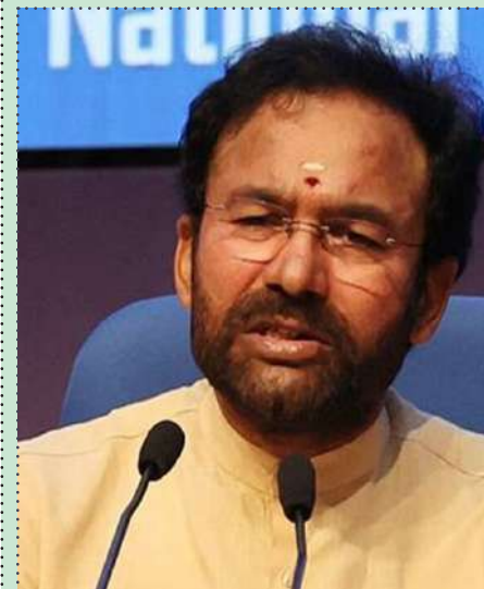
Minister for Tourism G Kishan Reddy