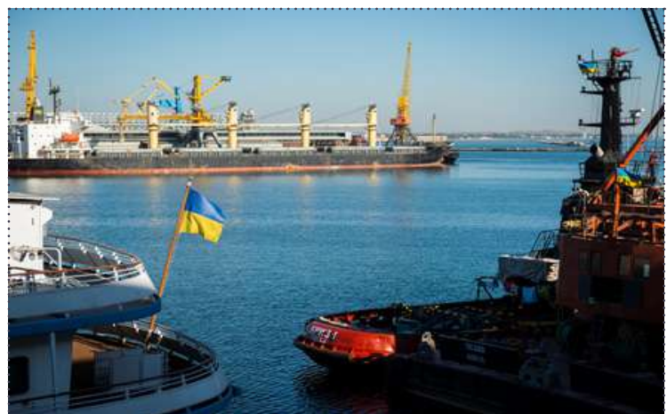
331 seafarers still trapped on vessels in the Black Sea and Sea of

supporting the continued success of the Black Sea Grain Initiative, however this cannot come at the expense of innocent seafarers' lives. Action must be taken now. Without our seafarers, movement of the vital grain shipments out of Ukrainian ports would not have been possible. While there are challenges to evacuating seafarers and their ships, it must nonetheless be a top priority. Otherwise, we risk the lives of our seafarers, and this is unacceptable.