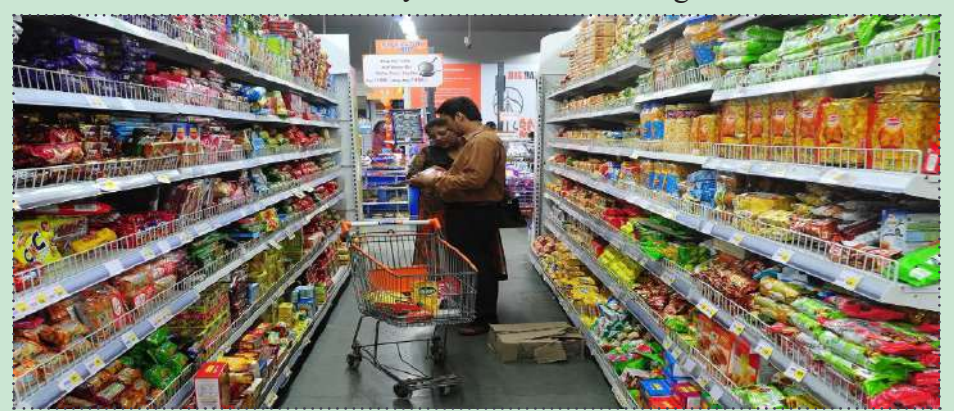
We remain confident that we can continue to grow ahead of the market in India, says Unilever CEO Alan Jope

PepsiCo also reported that its India business delivered doubledigit organic revenue growth last year and that it gained market share in both beverages and snacks