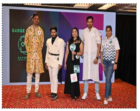
Maritime Personality Of The Year