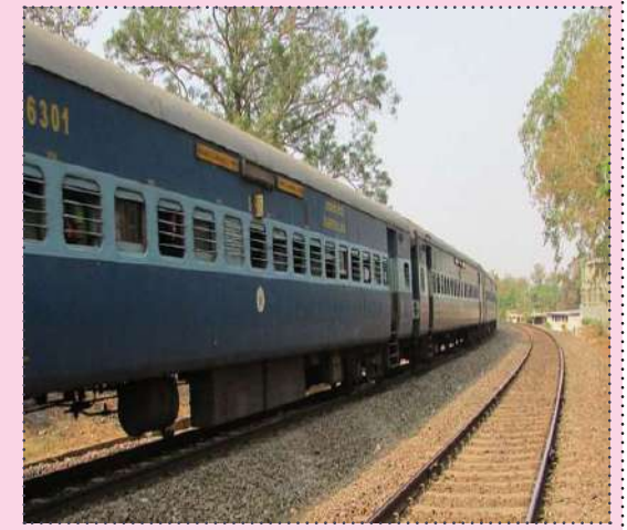
To prevent accidents Railways launch month-long safety drive

Officers have been instructed to spend sufficient time in the Section/Lobby/ Maintenance Center/ worksite to observe the operational/ maintenance/ working practices, and interact with staff on the right and wrong practices to understand the problems being faced by field staff and provide solutions.