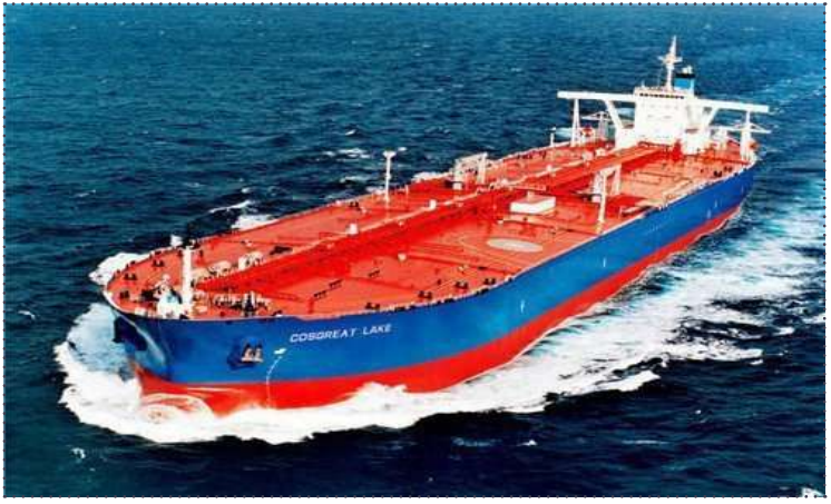
Vintage VLCCs are selling faster at higher prices as each week of the year passes, with the most active selling nationality being Chinese.

Over the weekend. sources told Splash that the 21-year-old, 300,000 dwt, Japanesebuilt COSGLORY was sold to undisclosed interests for $43m, while the same sized