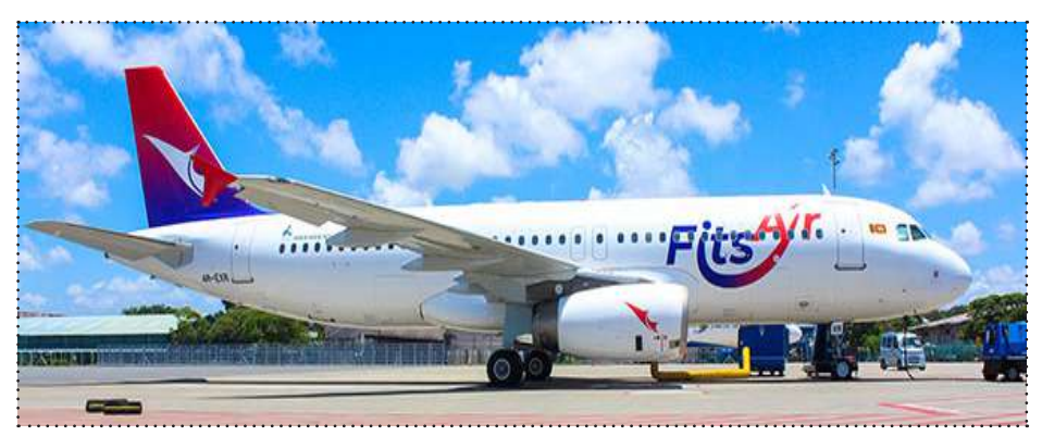
Fits Air is looking to be a leading low-cost carrier in the region