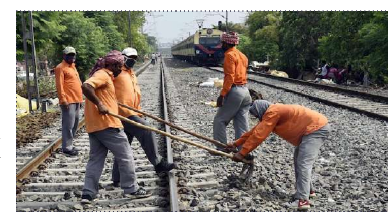
Railway track doubling

Aurangabad and Ankai in Maharashtra. This will provide an alternate route to reach the long destinations like Mumbai, New Delhi, Amritsar from Bangalore, Hyderabad, Nizamabad etc," the commerce and industry ministry said. The doubling can also cater to the potential freight traffic movement from the nearly industrial clusters as it falls on the Aravali Dakshin Sampark Corridor.