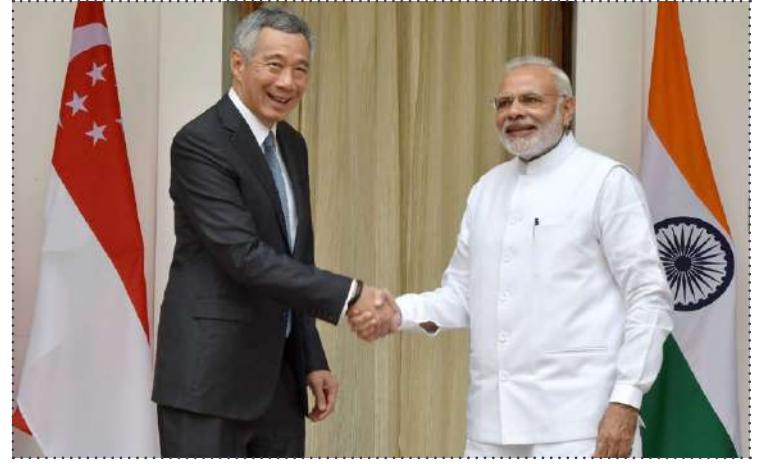
Prime Minister Narendra Modi and Prime Minister of Singapore Lee Hsien Loong