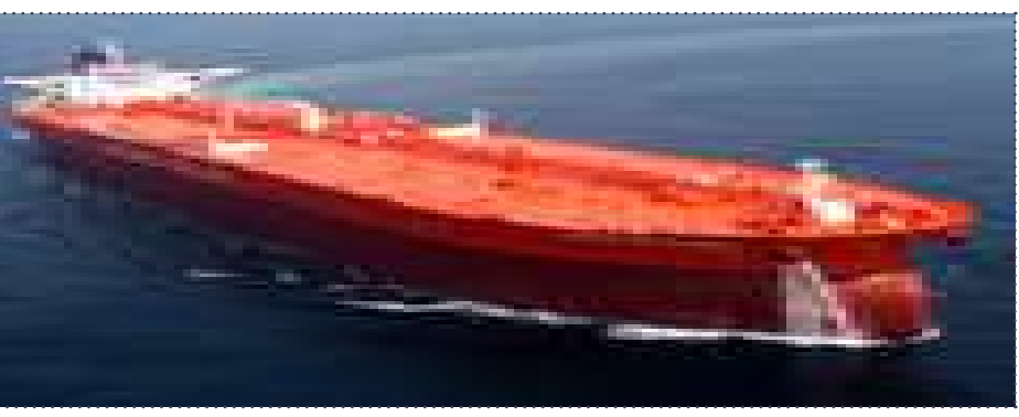
Shadow fleet of Russia's oil tankers likely to face sanctions from EU

According to them, company secretly hosted 92 ships of Russian state-owned company Sovcomflot in April 2022. It was done in order to organize the secret transportation of Russian oil in the