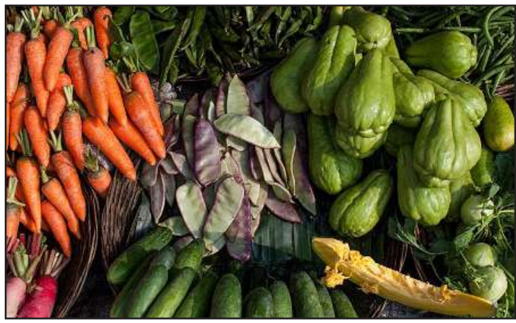
Sikkim's organic products

He suggested establishing a state-wide organic testing laboratory for farm-to-lab traceability Additionally, checks. he insisted that existing infrastructure be utilized