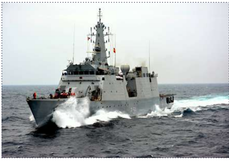
Indian Naval Ship Sumedha arrived at Abu Dhabi, UAE on 20 Feb 2023 to participate in NAVDEX 23

ndian Naval Ship Sumedha arrived Abu Dhabi, UAE on 20 Feb 2023 to participate in NAVDEX 23 (Naval Defence Exhibition) and IDEX 23 (International Indian Naval Ship Sumedha arrived at Abu Dhabi, UAE on 20 Feb 2023 to participate in NAVDEX 23 Defence Exhibition). scheduled from 20 to 24 Feb 2023. The ship's participation in two leading regional naval and defence exhibitions will showcase the strengths of India's indigenous ship building underscore the Hon'ble Prime Minister's