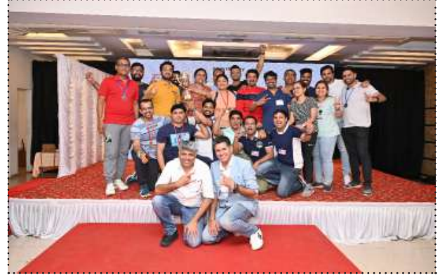
Indian Register of Shipping - Gold (Leaders of Overall Medals Tally)

INDIAN REGISTER OF SHIPPING came in with a large contingent and an unbeatable spirit & bagged the Gold (Leader of Overall Medals Tally) for MISL 2023.