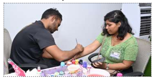
Fest Arena @MISL 2023

Team Offing thanks all the participating companies & participants and is looking forward to the next edition in 2024 & promises to make it their biggest yet! For more information, please visit www.misl.in