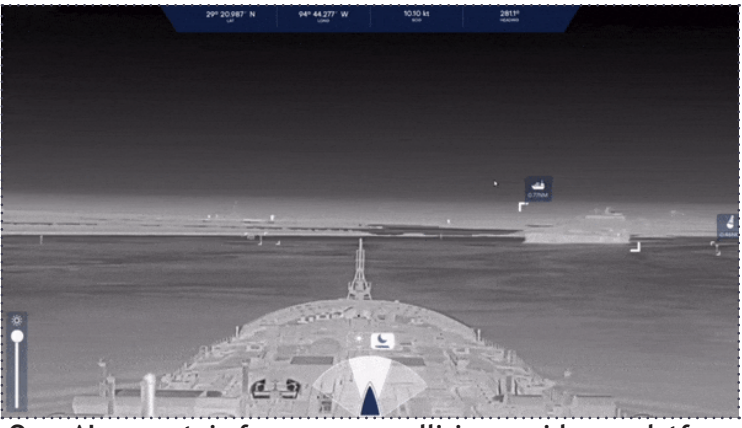
Orca Al co-captain for crews, a collision avoidance platform helping the crew to make informed decisions besides avoiding human errors

Shipping companies can better protect marine life and drastically reduce the thousands of whales