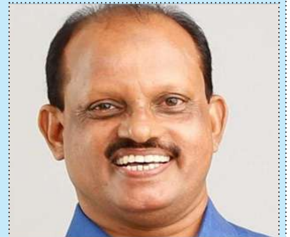
Port minister Ahammed Devarkovi

The substation is equipped with three transformers, switchboards, control equipment, etc, to allow distribution of electrical supply to various parts of the site at the required voltage levels. It also has an