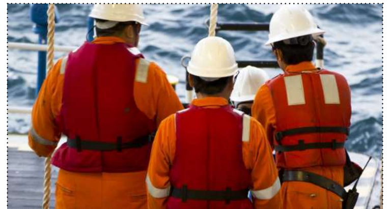
A move to benefit Merchant Navy Indian Seafarers

"These are small amendments, but it will have a major impact on Indian seafarers," the official said, adding that the proposed amendments are in line with the Maritime Labour Convention (MLC) adopted by the International Labour Organisation (ILO) in 2006.