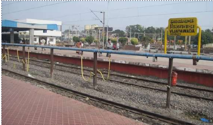
Vijayawada railway station.