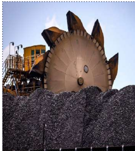
China Steps Up Purchases of Australian Coal

imposed after relations between Beijing and Canberra turned sour