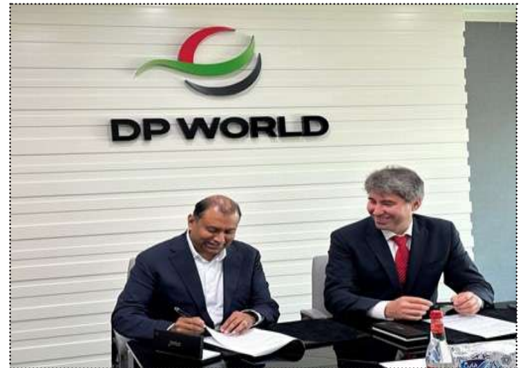
DP World and CCCSA sign an agreement to help digitalise international trade

Customers simply input the place of loading and required destination. SeaRates then offers the most streamlined way of making that delivery from its network of freight