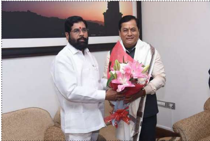
Union Ports Minister Sarbananda Sonowal greeted by Maharashtra chief minister Shinde

Out of the total 114 projects being implemented in the state of Maharashtra, 43 projects worth Rs. 2121 Crore are partially funded by the Union Ports Ministry. He said out of 43 projects, 37 projects worth Rs 1,388 Crore, 9 projects worth Rs 279 Crore have