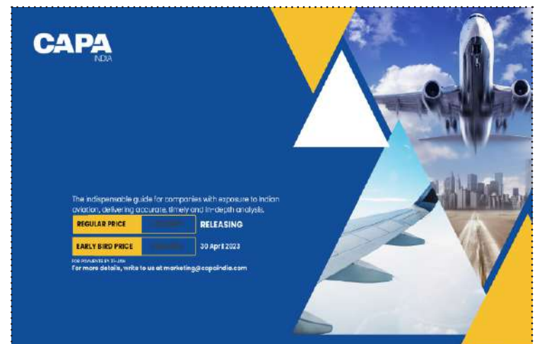
CAPA said India has long shown promise but has struggled to realise its potential

While noting that the development of airport infrastructure is continuing and economic regulation is maturing, CAPA said India has long shown promise but has struggled to realise its potential. It may finally be set to take its place as the global aviation market of the 21st century, said a report.