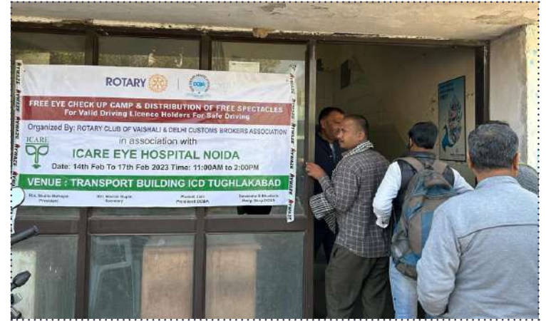
Eye check up camp at the Transport Building of ICD Tughlakabad, New Delhi,