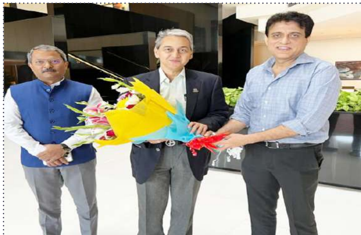
Shipping secretary for a review meeting at JNPA