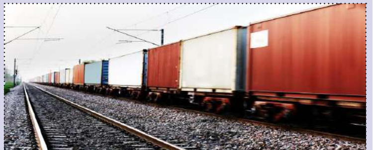
Soon, goods and parcel trains to be 'sealed' with OTP-based digital locks to guard against theft

The train will also be tracked and the location will be recorded. If door tampers or collision occur, an alert message will be