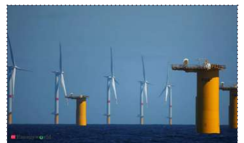
Offshore wind energy block

This is a high-value project as the initial costs of installing the generators are very high, but running costs will be low. A public-private partnership for constructing and running the plant is the option under consideration. The plant will be free of emissions that are associated with coal-fired plants and those that run on LNG.