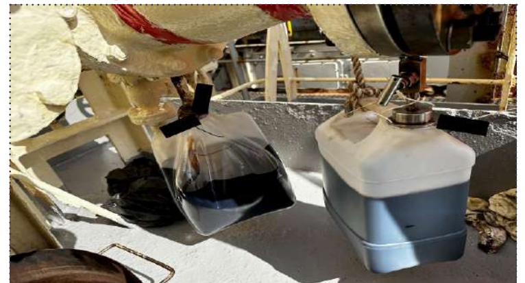
A sampling procedure carried out by the surveyor at the ship bunkering manifold during bunkering.

"The maritime industry has many interconnected players, and collaboration is key in moving our decarbonization ambition forward. It is encouraging