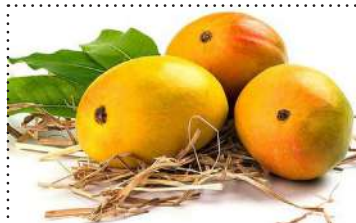
Maharashtra Alphonso mangoes

India exported around 1,000 tonnes of mangoes to the US last year and aims to expand its footprint to high-value markets including the United States,