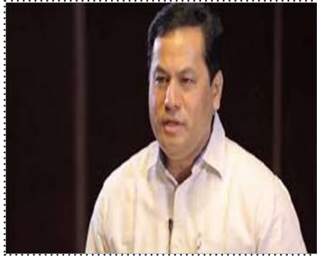
Shipping Minister Sarbananda Sonowal