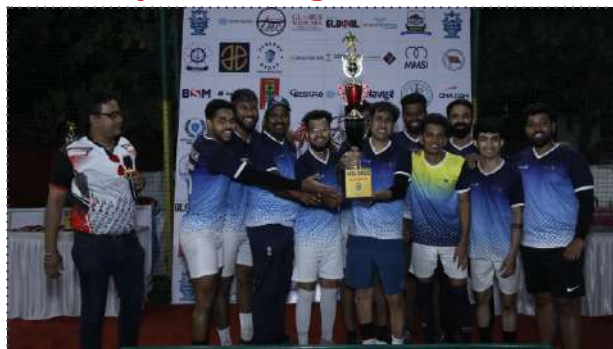
Runner Up - Elegant Marine