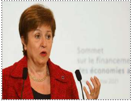
IMF MD Kristalina Georgieva

That is the fastest growth rate among major economies.