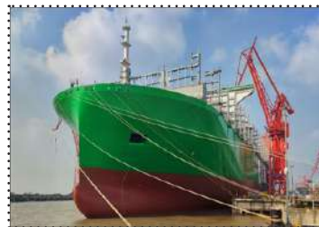
A 24,000 teu vessel

the 24,000 TEU, 13,000-15,000 TEU and vessels of at least 7,000 TEU.