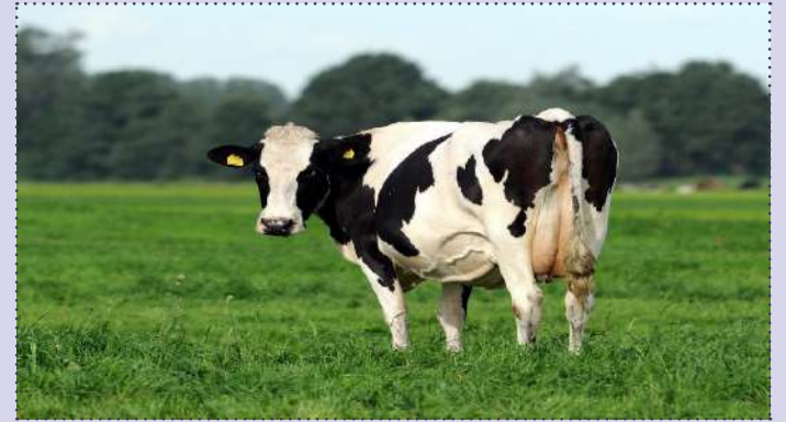
Dutch cow looking back

In its quest to decarbonize shipping, Japan-based Mitsui O.S.K. Lines is turning to cow manure.