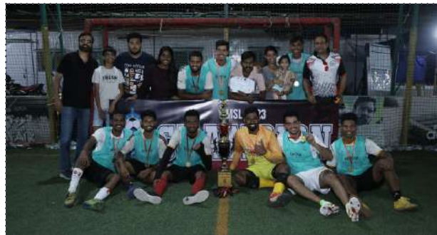
Winner of MSL Season 4 - Hapag Lloyd

Winner of MSL Season 4 – Team Hapag Lloyd