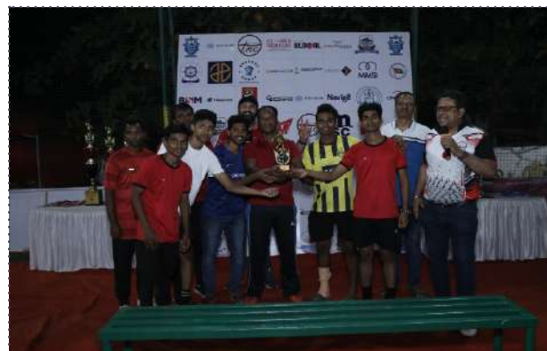
Mind Over Water Fair Play Award -Team NGT

Mind Over Water Fair Play Award: Team NGT