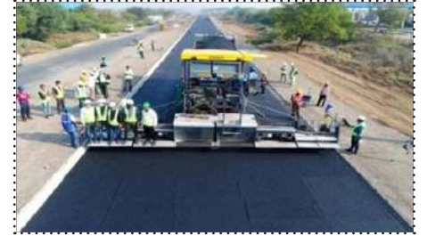
To construct roads, NHAI exploring use of Phosphor-Gypsum

already used 'Fly Ash' in the road construction project and in building flyover embankments. It is a fine residue of coal combustion in Thermal Power Plants (TPPs).