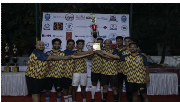
Second Runner-Up - Anglo-Eastern

Mind Over Water Fair Play Award: Team NGT