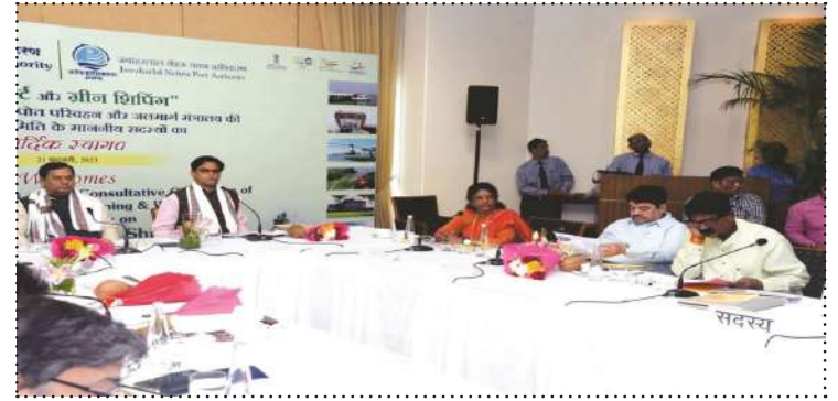
Meeting of the Consultative Committee of MoPSW in Mumbai this week

To enhance the share of green shipping, various projects are being implemented by Cochin Shipyard Ltd, India's largest shipbuilding and maintenance facility. These include green urban mobility solutions like hybrid electric ferries, autonomous zero-emission vessels, pilot project on