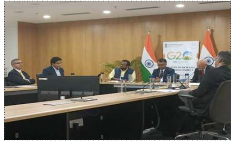
Discussion is on;IREDA is planning to establish an office in Gujarat's GIFT City to finance Renewable Energy projects in foreign currency.

CMD, IREDA also highlighted that all the major multilateral and bilateral agencies such as World Bank, KfW, JICA and ADB, etc. preferred