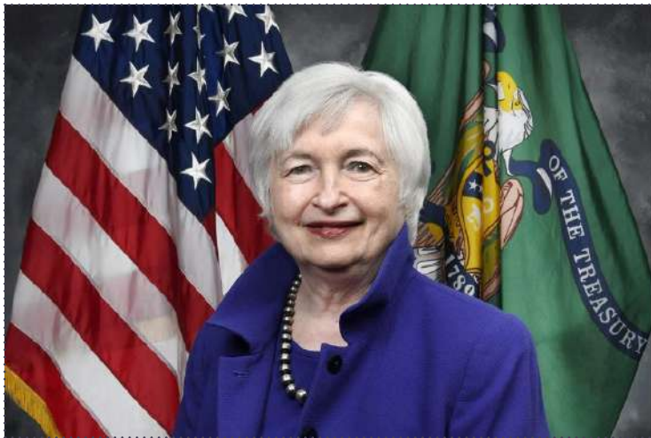
US Treasury secretary Janet L Yellen

As we look towards the future, United States is eager to deepen its ties with India in the technology sector. It is advancing an approach called "friend shoring" to bolster the resilience of our supply chains. We are doing this by strengthening integration with our many trusted trading partners, including India. We are seeing progress; as an example, technology