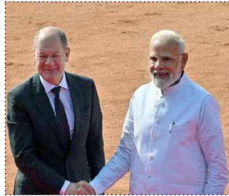
German Chancellor Olaf Scholz and PM Modi

"We need talent, we need skilled workers. The development of IT