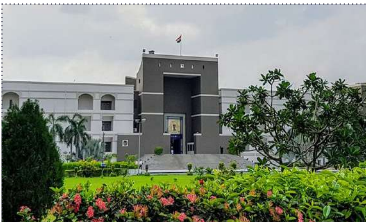
Gujarat High Court

The move pertains to a writ petition filed by some sugar