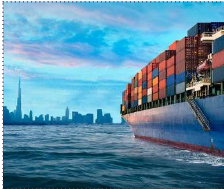
Another boom year for the industry says shipping hedge fund

ore and coal to power industrial production, and oil for cars and trucks, offer insights into the pace of recovery. Likewise, container ships haul billions of dollars of manufactured goods from factories in China to consumers globally.