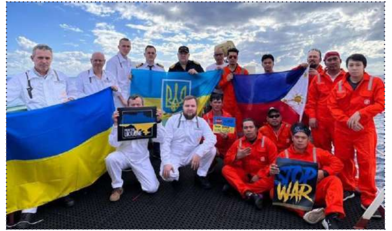
Ukrainian and Filipino crew aboard the ship 'Regina Oldendorff' showing their support for peace.

Unions renewed calls for everything possible to be done to end the war in Ukraine. "The world is in chaos, but it's not because of transport workers. We have kept