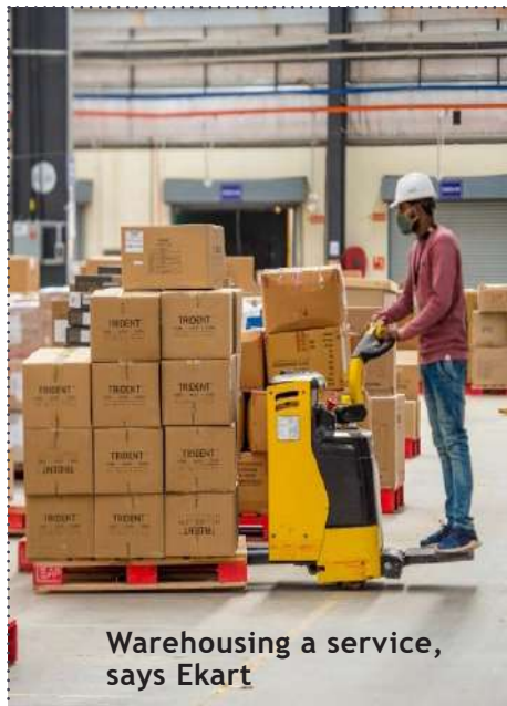
Warehousing a service, says Ekart

The initiative will enable brands of all sizes, manufacturers, and retailers from across industries to leverage Ekart's technologically advanced fulfilment centres for flexible, affordable, and scalable inventory storage solutions, said a release.