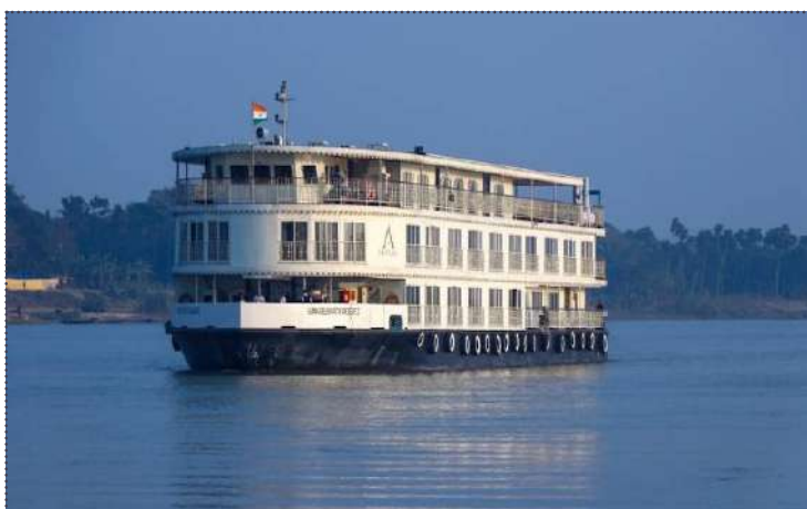
The World's longest river cruise 'MV Ganga Vilas'

will be organized by the Inland Waterways Authority of India (IWAI), under the aegis of the Ministry of Ports, Shipping and Waterways, Government of India in Dibrugarh on the same day.