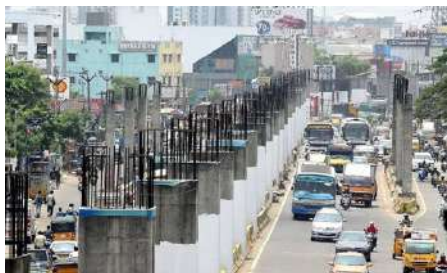
Chennai Port Maduravoyal elevated corridor