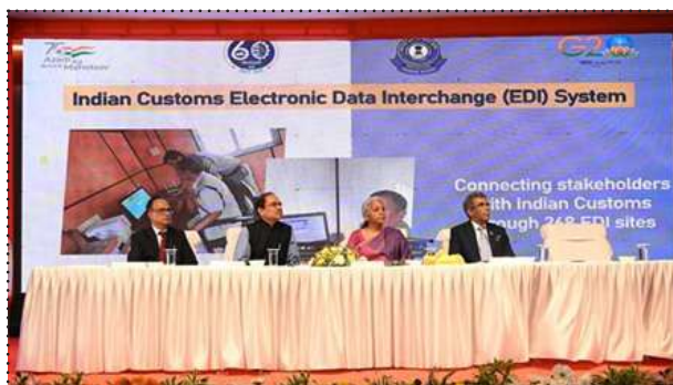
Inauguration of ICES by FM Nirmala Sitharaman

These two land customs stations would examine goods moving from India to Nepal and Bhutan.