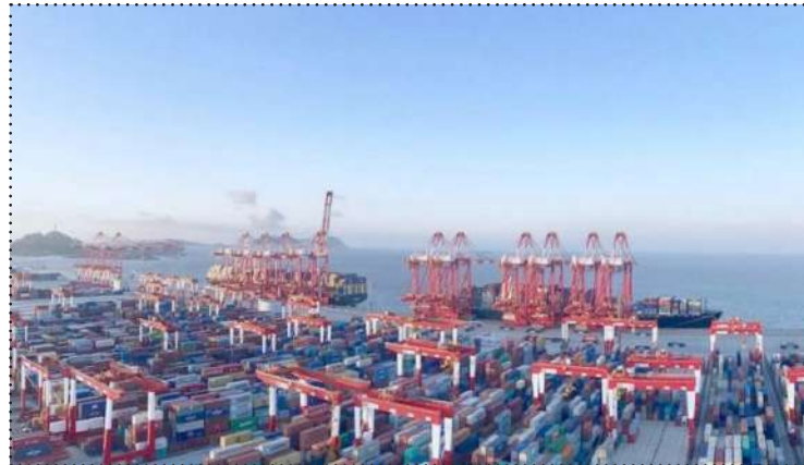
Spot prices for container exports from Shanghai fall 2.9%, according to SCFI