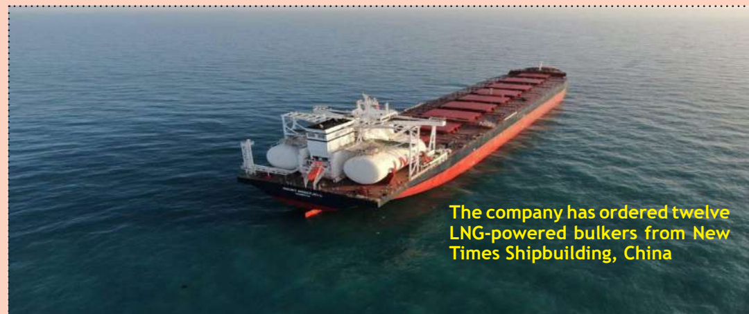
The company has ordered twelve LNG-powered bulkers from New Times Shipbuilding, China

Himalaya said in the statement that it expects to take delivery of a