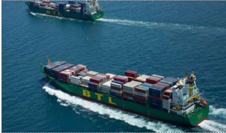
BTL new service to connect India with Saudi and Iraq