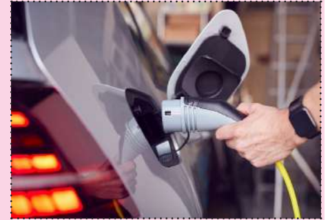
Electric vehicle charging

Investment will also be made in geo-fencing, breakdown back-ups