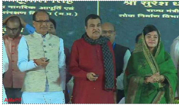
Union Minister for Road Transport and Highways Nitin Gadkari inaugurating 7 National Highway projects in Rewa, Madhya Pradesh.

The Minister informed that the movement of vehicles in the Rewa-Sidhi section will be facilitated