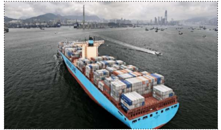
Maersk Line with the highest number of ships idled at the moment

While the previous Dragon loop had a dozen 14,000 TEU ships and was jointly operated by MSC