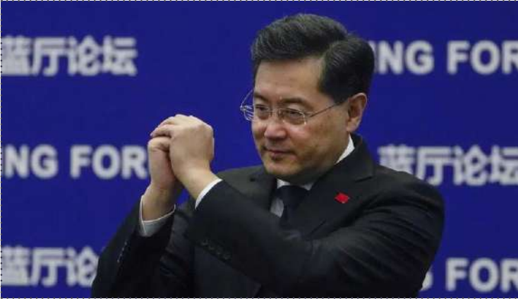
Chinese Foreign Minister Qin Gang

We should put the border issue in the appropriate place in bilateral relations and promote the early shift of the border situation to normalized control," Qin told our external affairs minister Jaishankar during