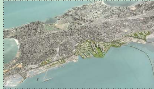
Port land for housing schemes and rehabilitation