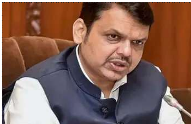
Maharashtra Deputy Chief minister Devendra Fadnavis

Karnataka's capital is home to a slew of technology companies, global delivery centers and also innovative startups due