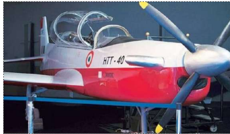
The acquisition of the HTT-40 would boosting efforts towards the 'Aatmanirbhar Bharat'. (Photo/File)

The HTT-40 is a turboprop aircraft designed to have good low-speed handling qualities and provide better training effectiveness. It has a fully aerobatic tandem seat turbo trainer with an air-conditioned cockpit, modern avionics, hot refueling, running change over and zero-zero ejection seats.