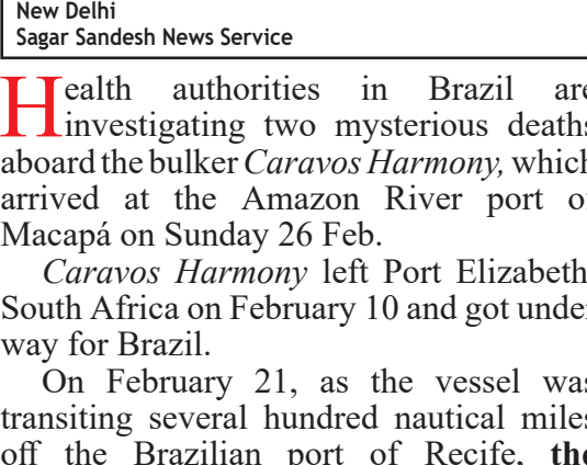
Caravos Harmony