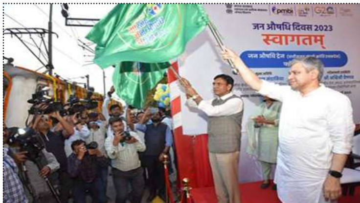
Jan Aushadhi train flagged off by two ministers in New Delhi, 3 March

Also, the similar train from Pune to Danapur has been flagged off covering 4 States for 2 months for generating awareness