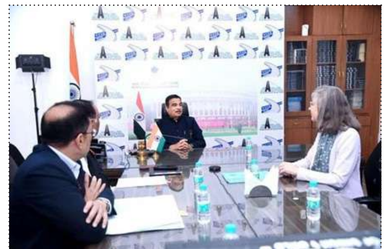
Union Minister for Road transport and Highways Shri Nitin Gadkari met Austrian Delegation led by Ambassador of Republic of Austria to India, Ms. Katharina Wieser.

The meeting paved the way for strengthening India's continued partnership and developmental cooperation with Austria for